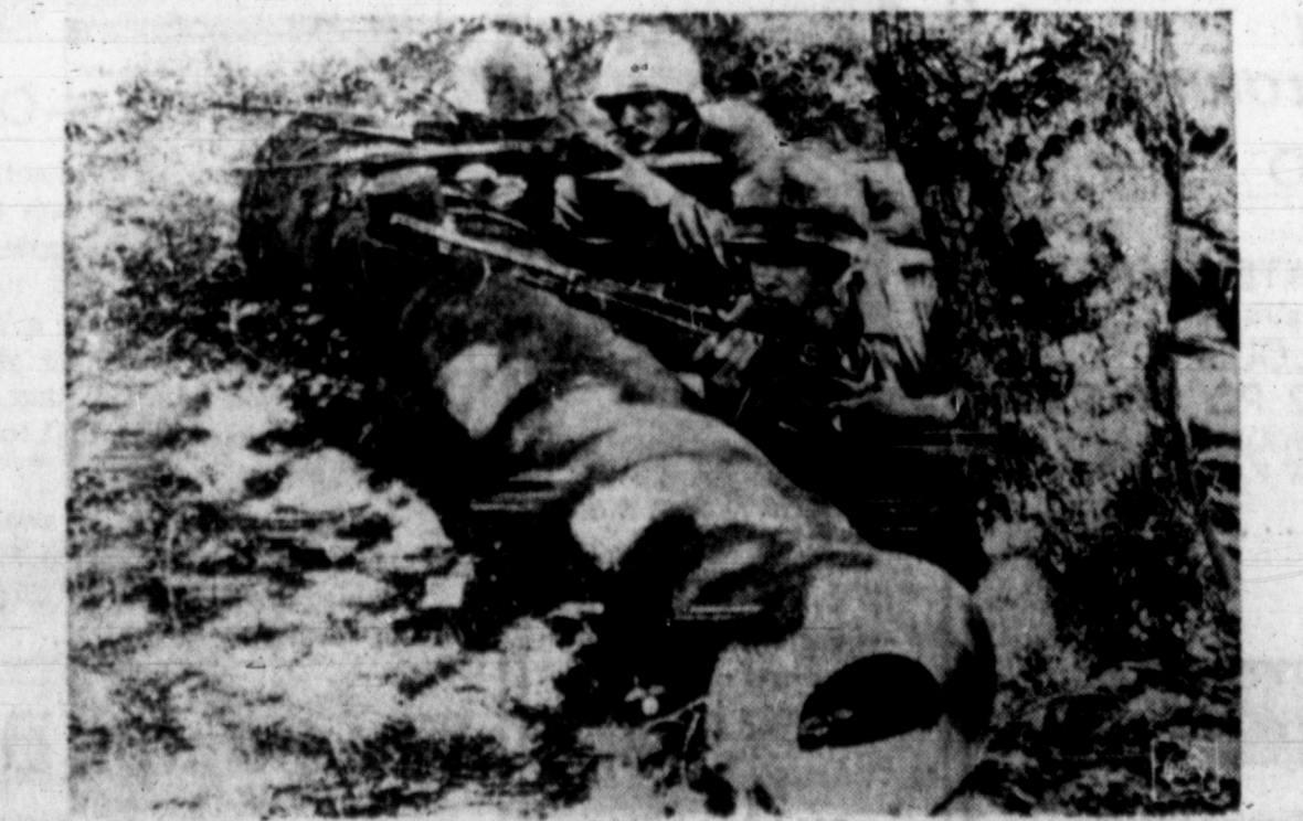
SEEKING SNIPERS — Marines on patrol duty at Haina, near Santo Domingo in the Dominican Republic, use an ancient cannon as a barricade while searching for snipers.

SANTO DOMINGO (UPI) — The four-member fact-finding panel sent here by President Johnson is trying to arrange a new coalition government made up of Dominican junta leaders and the "constitutionalist" rebels, informed sources said today.