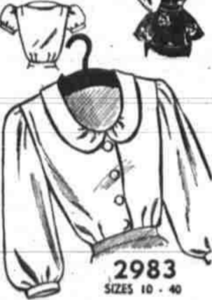
2983 SIZES 10 - 40

Blouses pretty enough for party purposes, each so distinctly styled it has a custom-made air. (Two separate patterns.) No. 2983 is cut in sizes 10, 12, 14, 16, 18, 20, 22, 24, 26, 28, 30, 32, 34, 36, 38, 40. Size 16, 2 1/2 yds. 39-in. No. 2418 cut in sizes 10, 12, 14, 16, 18, 20, 22, 24, 26, 28, 30, 32, 34, 36, 38, 40. Size 16, 2 yds. 39-in. Sends 25 cents for EACH PATTERN with Name, Address and Style Number. State Size desired. Address: PATTERN DEPARTMENT, Big Spring Herald, 121 W. 19th St., New York 11, N. Y. Would you like to see a collection of more than 150 other pattern styles? Just include the FALL-WINTER FASHION BOOK in your pattern order and you'll be delighted with the wide selection of designs for all size and age groups, and all occasions. You'll also get many suggestions for easily made gifts that will stretch your Christmas budget. Price of book 25 cents. Mrs. Harwood Keith and Mrs. J. P. Dodge have returned from the State Federation of Women's clubs in Austin. Both represented the local Modern Woman's Forum.