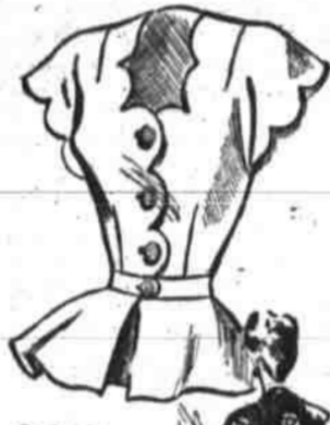
2418 SIZES 10 - 40