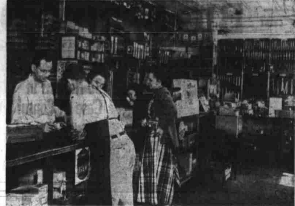
POPULAR PLACE—Walker Auto Parts Company, 408 E. 3rd, is a popular and pleasingly busy place. And why shouldn't it be, what with its exhaustive stocks of parts and accessories for all types and models of cars? Garagemen as well as individuals have found it a place where orders can be filled quickly, courteously and at reasonable prices. Walker's anticipates needs, before they arise. (Mathis Photo).

world over for the serviceability. The customer will find such other useful items at the Thomas store as pen and pencil sets, desks, chairs, filing cabinets, Samson tables and chairs, desk calendars, fluorescent desk lights Speed-O-Print mimeographs and supplies for mimeographs. Everything to outfit the modern office is available at the Thomas establishment.