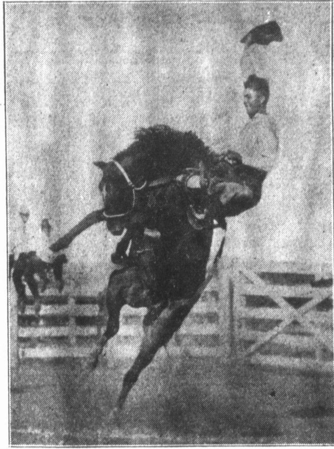
Any old port in a storm, but this cowboy is doing his best to stay put on the hurricane deck of a wild bronk at the Anvil Park rodeo which opened at Canadian this afternoon.