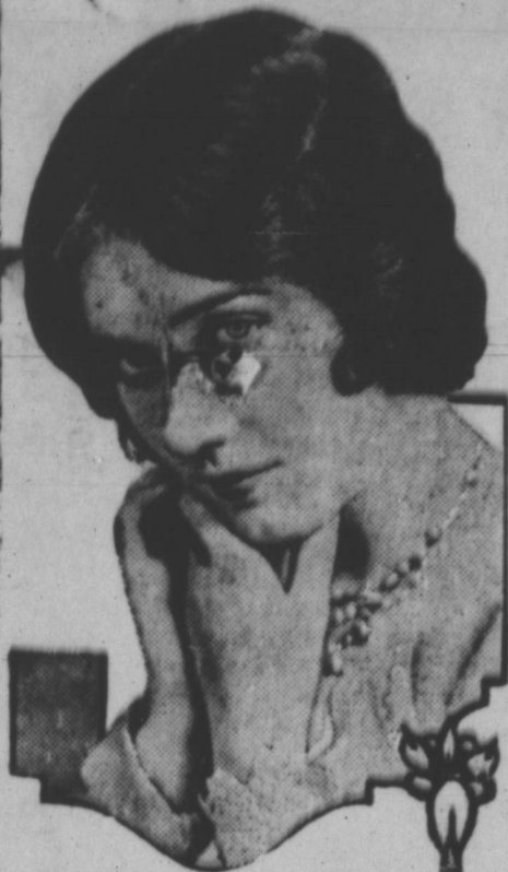
This new screen star has the leading role in "The Wedding March." Miss Wray is regarded in motion picture circles as the find of the year.