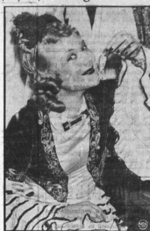
It turned out after all that Sonja Henie didn't need the rabbit's foot she kisses about for luck before making her professional debut in New York. The throng of admirers who packed Madison Square Garden cheered lustily for each least stunt the Norwegian figure skating champion put her skates to.