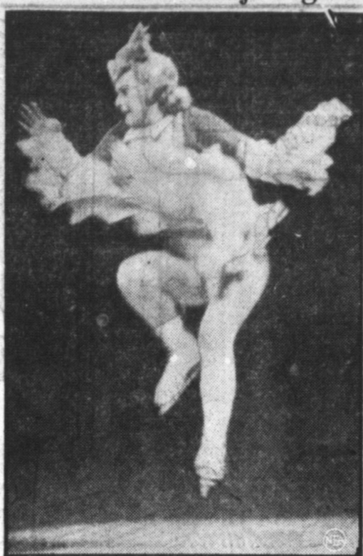
And here you see Sonja leaping into the affections of the galleries, a whirling, flashing figure on skates, idol of more than 16,000 pairs of eyes. Between her appearances the throng was entertained by a hockey game between two amateur teams; but Sonja netted about $10,000 for her efforts.