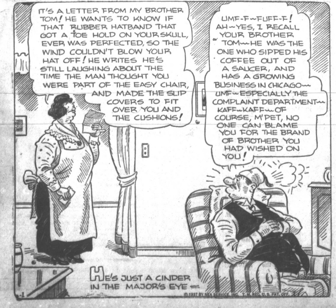
It's just a cinder in the Major's eye.