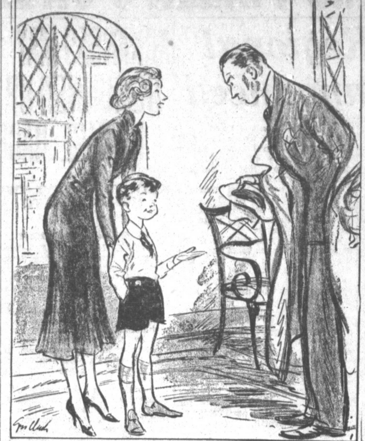
"Junior was very good today. You owe him a dime for eating his lunch and a quarter for taking his nap."