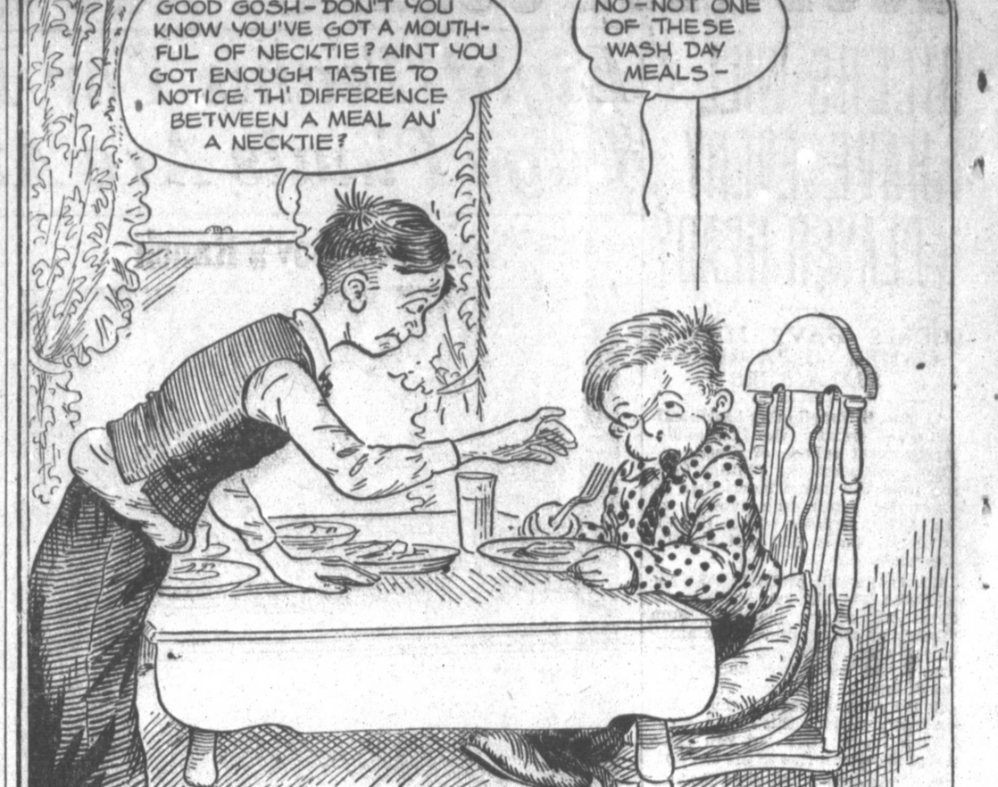
"GOOD GOSH—DON'T YOU KNOW YOU'VE GOT A MOUTHFUL OF NECKTIE? AIN'T YOU GOT ENOUGH TASTE TO NOTICE TH' DIFFERENCE BETWEEN A MEAL AN' A NECKTIE?" "NO—NOT ONE OF THESE WASH DAY MEALS—" A PERFECT LIKENESS.