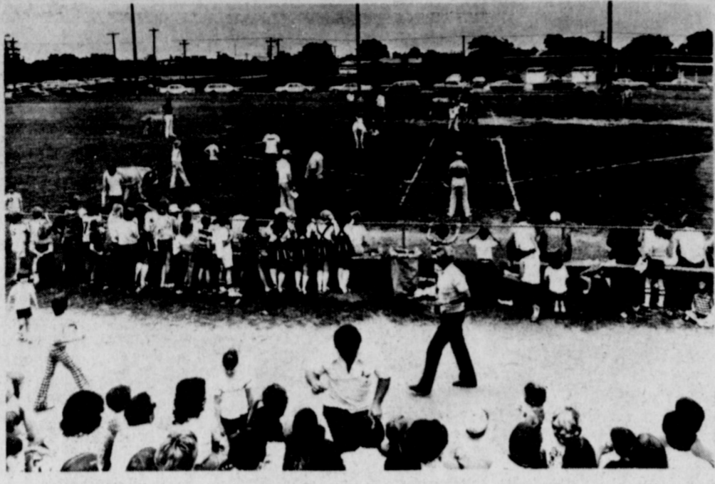
LOOKIN' FOR SOME FUN-- If you will just be at Roger Miller Park Monday evening at 8 p.m., you will find a lot of fun. The major league coaches will take on the minor league coaches in a different type of ball game. This one is donkey ball and a lot of fun is promised for everyone who turns out to watch the trained donkeys dump their riders, again, and again, and again, and.....