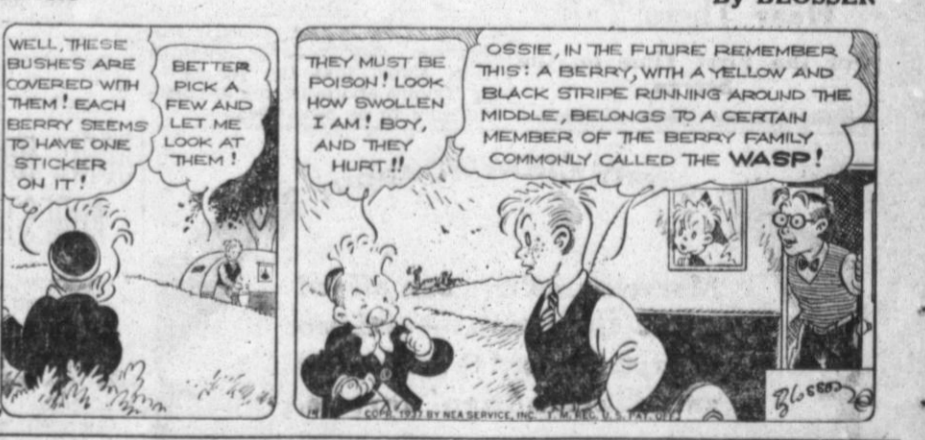
Music Hath Charms