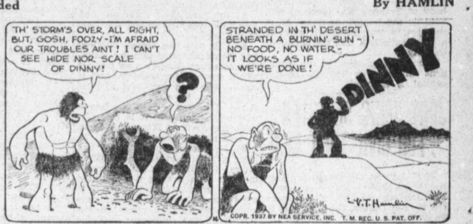
Easy is Optimistic