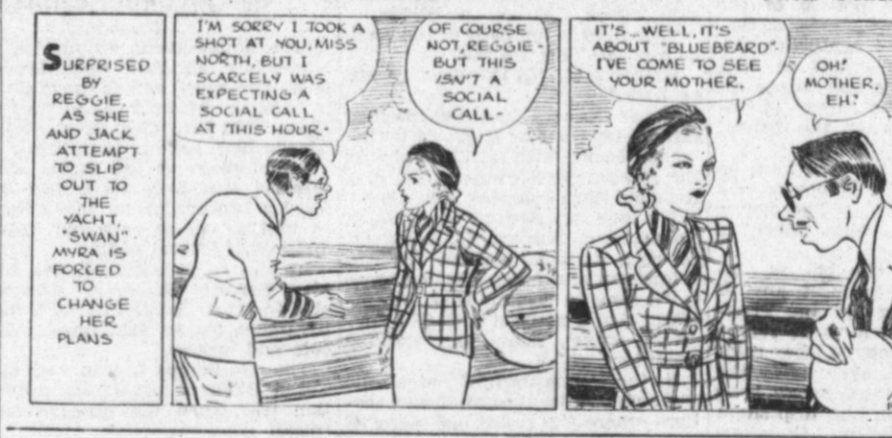
FRECKLES AND HIS FRIENDS