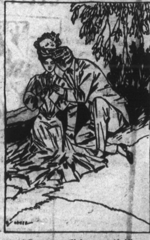
"Say you will be my wife! my life. I love you-I love you! I will wait for you if need be until the crack of doom. Say-say you will be my

"Shirley, I offer you all the devotion a man can give a woman. Say the one word that will make me the happiest or the most wretched of men. Yes or nol-Only think well before you wreck