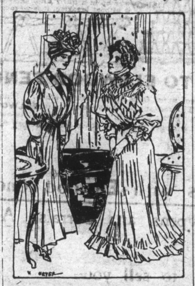
What a young girl you are to have made such a stir!"

ing connned so long indoors, and sue Shirley tried to look unconcerned as | walked with a more elastic and buoyant step than she had since her return Mr. Ryder home. Turning down Fifth avenue, she entered the park at Seventy-second street, following the pathway until she came to the bend in the driveway op-