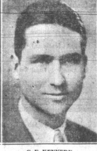
C. E. KENNEDY DeLuxe Cleaners