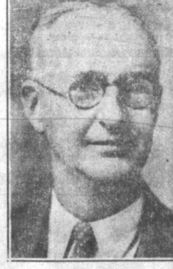
F. S. BROWN Standard Food Market