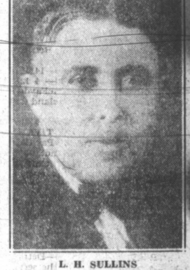
L. H. SULLINS Plumbing, Heating, Sheet Metal Works—111 East Kingsmill