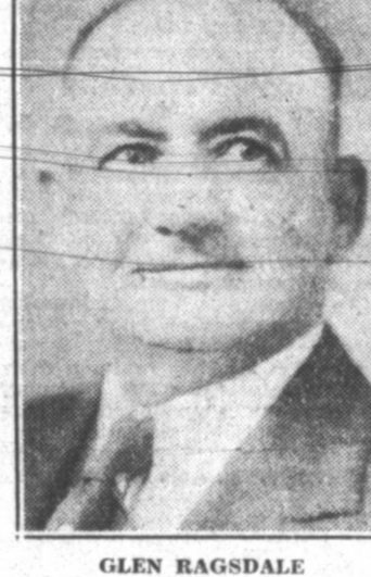
GLEN RAGDALE Plumbing