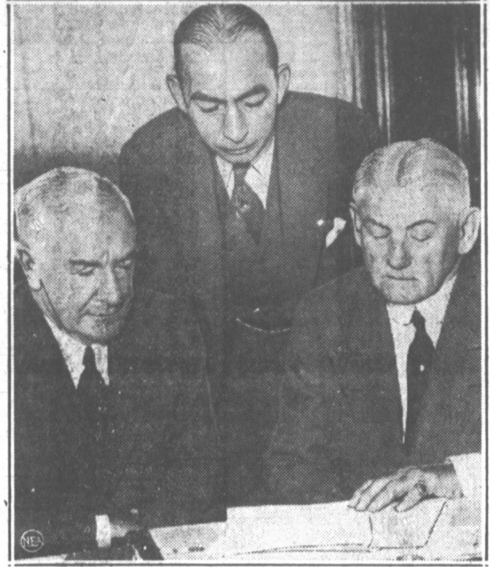
Republican campaign plans were in the making when these three party leaders put their heads together in Chicago as shown here.