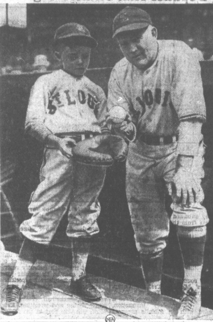
The name of Hornsby is destined to be in baseball for many years