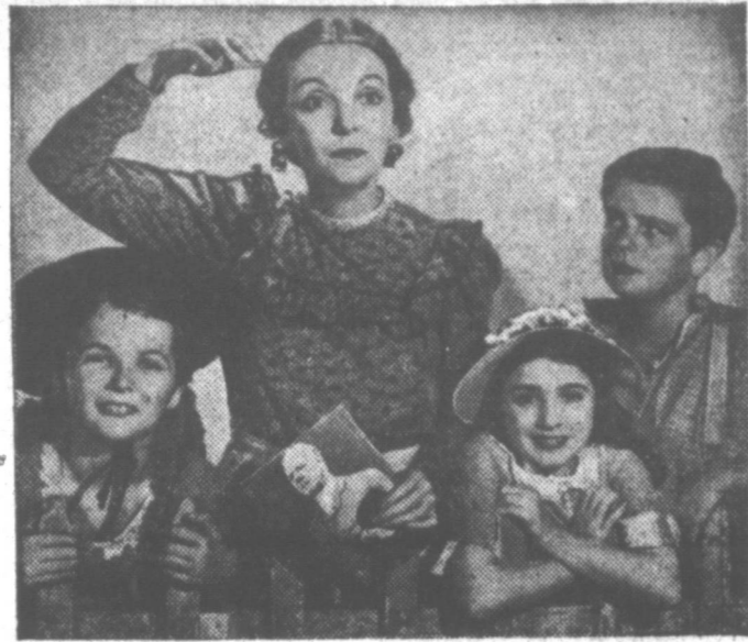
A scene taken from the popular "Mrs. Wiggs of the Cabbage Patch," which features W. C. Fields, Pauline Lord, ZaSu Pitts, Evelyn Venable, and Kent Taylor. The picture opens today at the La Nora for a 3-day run.