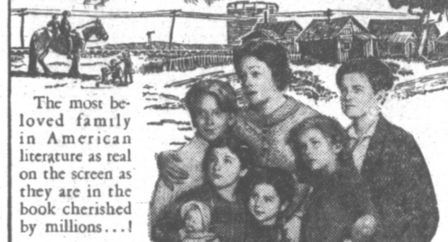
The most beloved family in American literature as real on the screen as they are in the book cherished by millions...

HERE THEY ALL ARE... And Thank Goodness They Haven't Changed a Bit!