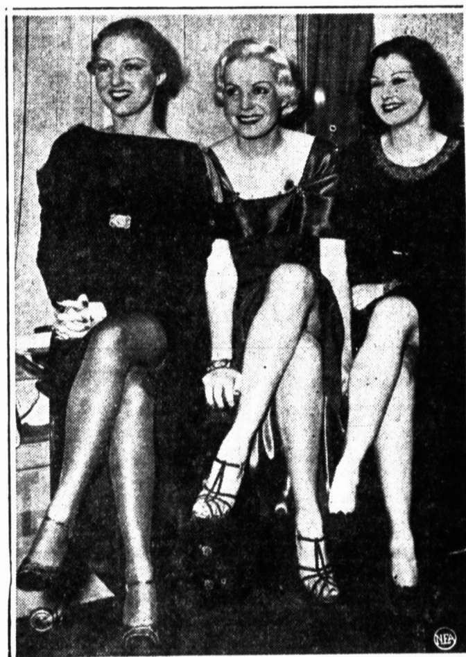
Once upon a time someone suggested selecting a beauty queen. The idea was so good everyone started to do it.