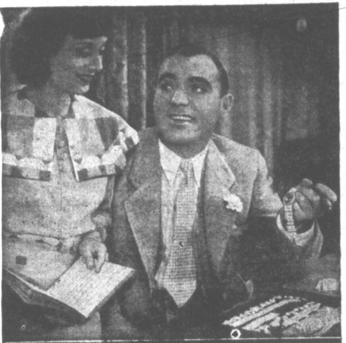
Pat O'Brien and Ann Dvorak, "I Sell Anything," a snappy comedy now showing at the Rex theater.