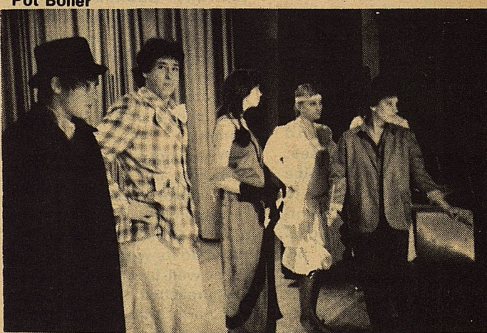
A scene from the "Pot Boiler"