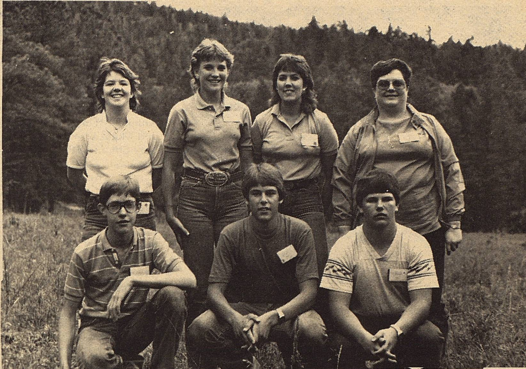
4-H ers ATTEND ELECTRICITY CAMP

washed frequently to prevent bacterial buildup. Only shoes with molded or vulcanized soles can be machine washed. Sports shoes with cemented soles must be hand washed.