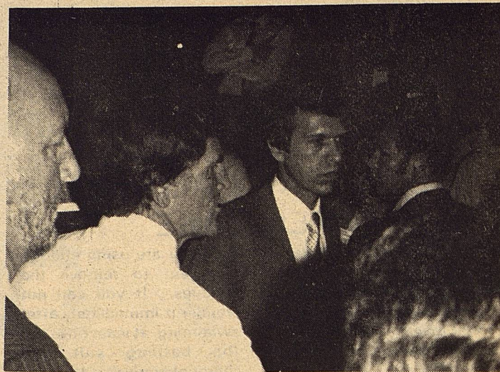
Gary Hart, Presidential Candidate on convention floor.

More than two-thirds of Australia is desert, making it the world's most arid continent.