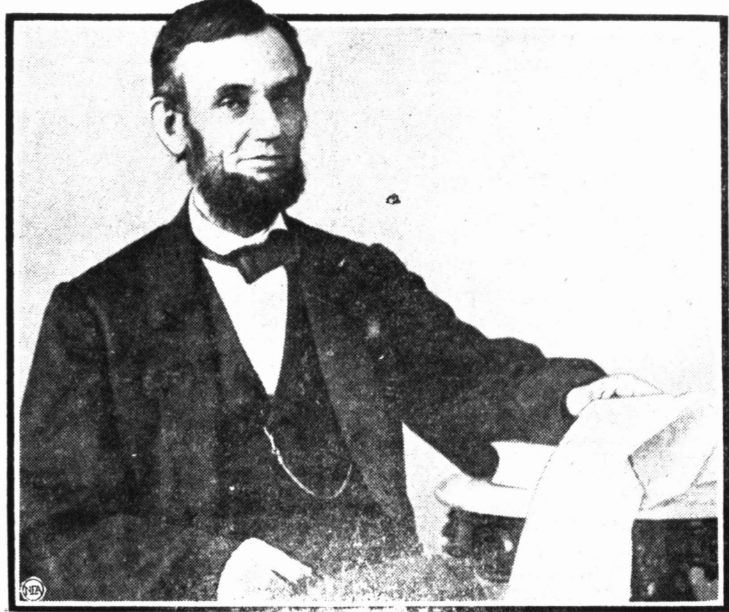
This picture of Abraham Lincoln, long undiscovered, came to light on his 125th anniversary. It is a pose taken in 1863, the negative of which never had been printed.