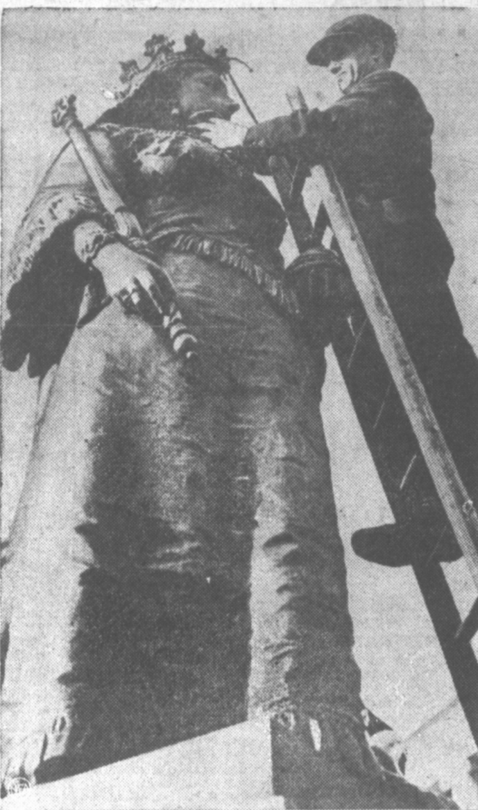
Tenderly and with great devotion to duty, a London cleaner goes about his job of cleansing the statue of Queen Victoria. Soap and water are used in the cleanup work on the great statue, which stands on the Thames embankment in the Blackfriars section.