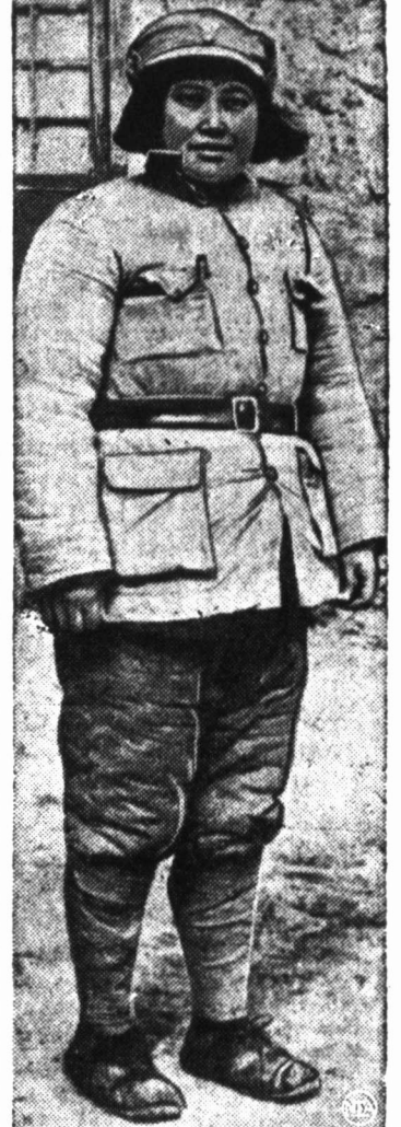
Co-ed students of a school whose classrooms are hidden in mountain caves, the young Chinese Communist girl shown at left in military uniform, has, with 200 others, sworn to "kill Japanese" as a means of ridding their country of the enemy.