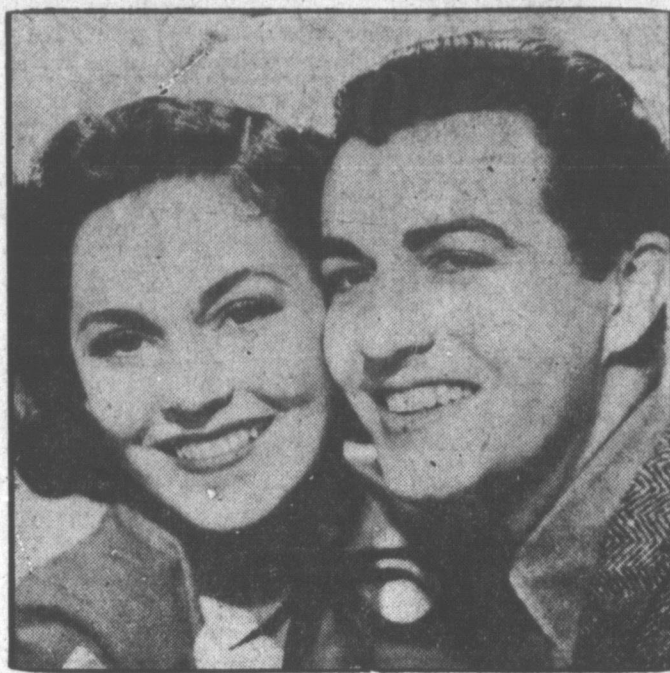
Maureen O'Sullivan and Robert Taylor play the leading roles in Metro-Goldwyn-Mayer's "A Yank at Oxford," showing today, tomorrow, Tuesday and Wednesday at the LaNora. Scenic beauties of ancient Oxford and her interesting traditions and the contrasts between American and English college life form the background for this new vehicle for Robert Taylor.