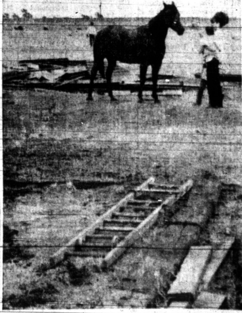
WIND DESTROYED this barn owned by L. B. Voyles, Rt. 2, Pampa. Mrs. Voyles was out early Monday morning checking the damage with Amy, 1, and Brad, 4. The ladder in the foreground is in the middle of the foundation of the building. The horse, in the center, was believed to be in the barn at the time but escaped injury. The barn was lifted about 40 feet from the foundation and then smashed on the ground.