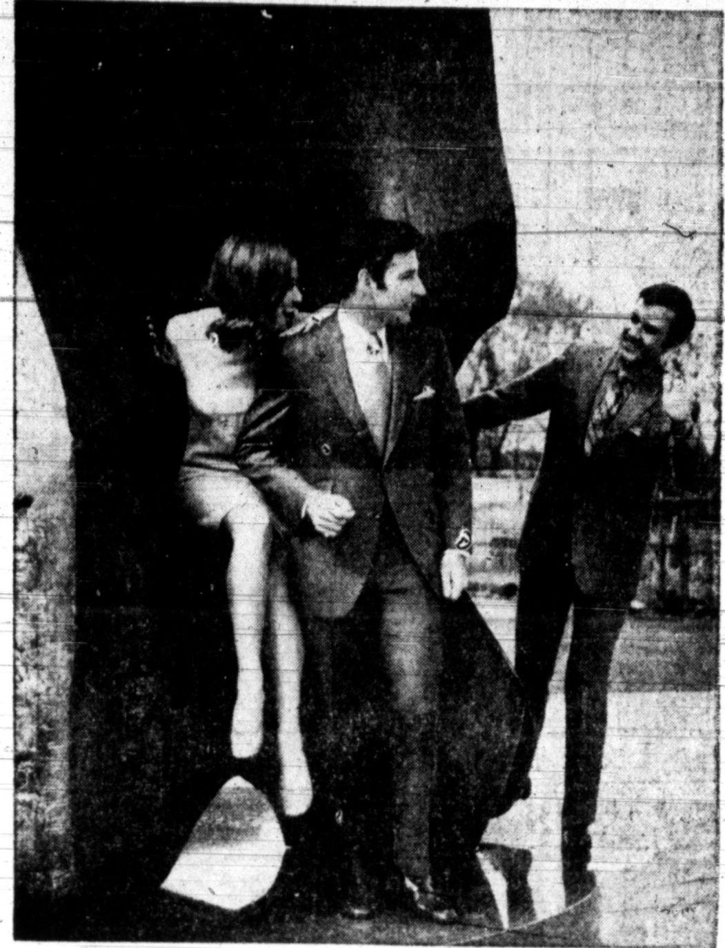
UP A TREE about what to wear as a couple? If unisex fashion is not for you, remember, men and women who coordinate their dress make a doubly good impression, according to designers who styled the one and two-button suits for Fall seen here. Pre-planning will avoid fashion faux pas.