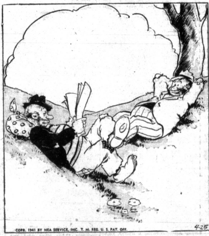
"Turn to the society page, Herschel—I'm itchin' to know what the Park Avenue set is doin' these days."