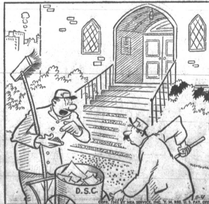
"Puffed rice! Boy, what a swell wedding this must have been!"