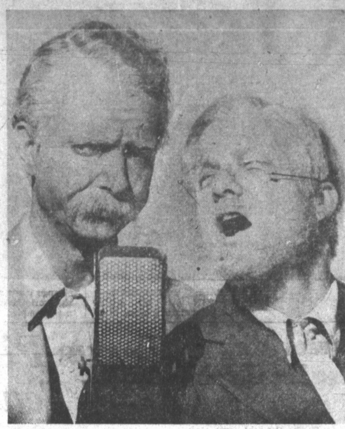
Lyman and Abner are at it again! Chester Lauck (left) as Lyman looks on wryly as Norris Goff as Abner demonstrates his ability as a songster. The two men are featured on the Lum and Abner program heard over KPND every Monday, Tuesday, Thursday and Friday at 12:15 and 9:45 p. m.