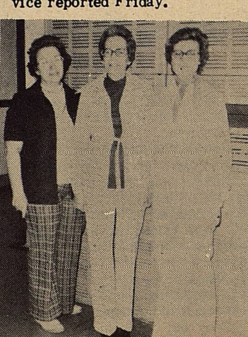
THE MONEY CHANGERS

High Plains samples classed totaled 8,800 for the week. Seasons total stands at 1,226,000. Total on this same date last year was 1,100,000, the USDA's Agricultural Marketing Service reported Friday.