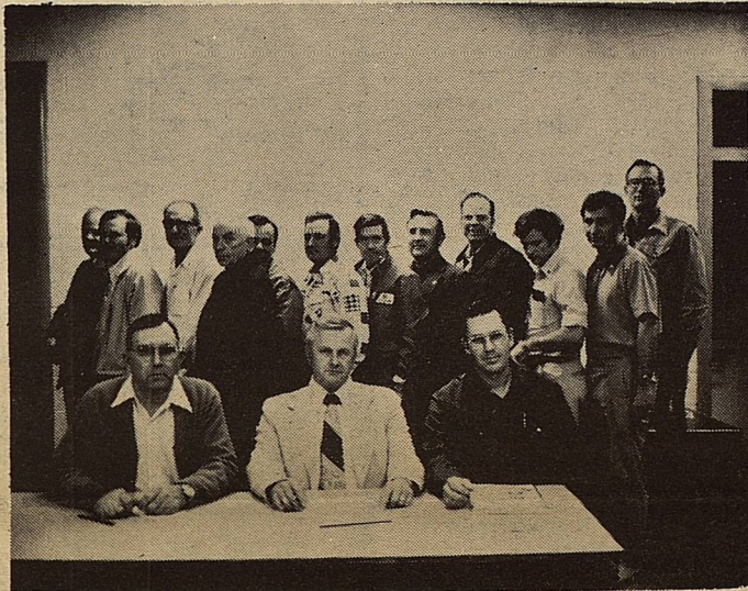
15 OF 27 CHARTER MEMBERS OF LIONS CLUB

After lunch, we just plan an evening of good singing, visitation and games for the children. The museum will be open for those who would love to brouse through recalling the "Good Ole Days" and reminising over the memories they will recall in the museum. THIS IS HOMECOMING DAY, WELCOME HOME, WE'RE LOOKING FORWARD TO HAVING YOU.