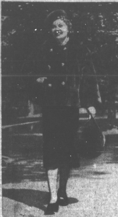
Fashion clues for bringing an old fur coat up to date are supplied by these two new fur styles. The model tries out style ideas for a kidskin coat, center, which were inspired by the bright-striped wool lining and matching ascot scarf of the new fur coat she models at right. At left, a nutria blazer which boasts gold but-

tons, matching fur beret and basket bag suggests new styling for a coat of outmoded length. After an old coat is shortened to blazer length, the left-over strip of fur may be used for matching accessories. A metallic scarf is used to pick up the gleam of gold buttons which brighten-the outlook of this jacket.