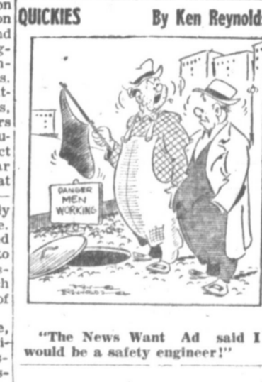
The News Want Ad said it would be a safety engineer!

But here's the one for the road—the road to death, defeat or victory. It may be the road that only a philosopher can explain the difference about at the end. But it was his trying.