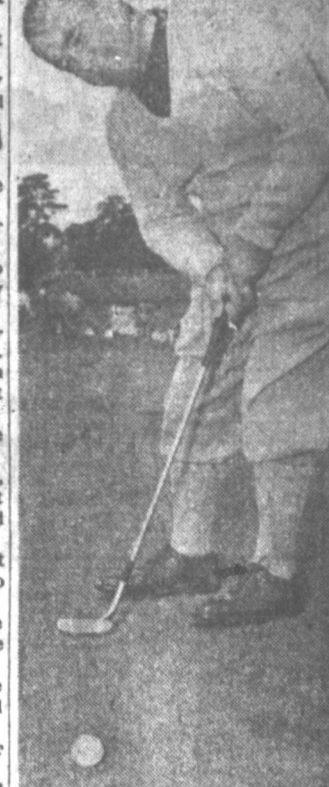
Gene Sarazen... keep the blade close to the ground, and square to the line of flight.

Winner of Them All A player who puts well is a match for any golfer. Putting is entirely different from the rest of your game. It is nothing more than merely stroking the ball smoothly and evenly.