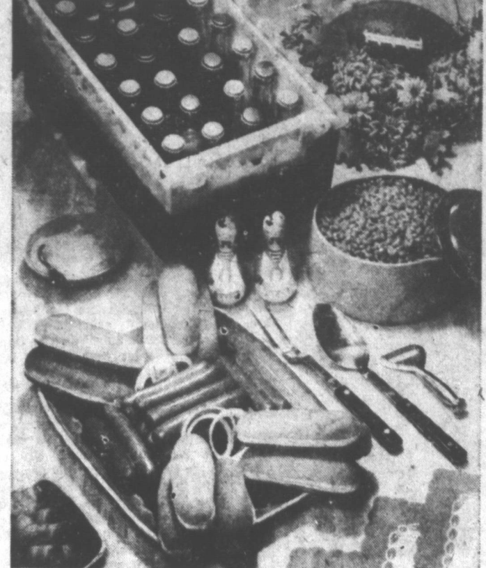
FOR INDOOR-OUTDOOR BUFFET assemble a case of soda pop, franks on a stick or on rolls and a "mess" of beans. By GAYNOR MADDOX