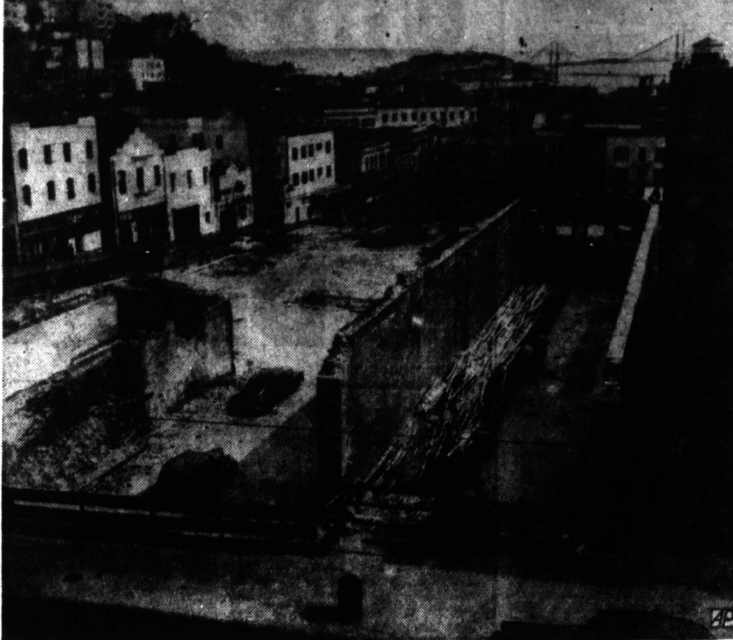
FACE-LIFTING IN CHINATOWN — Old buildings are being cleared away in San Francisco's Chinatown for a new project to house 234 families in a $2,500,000 development.