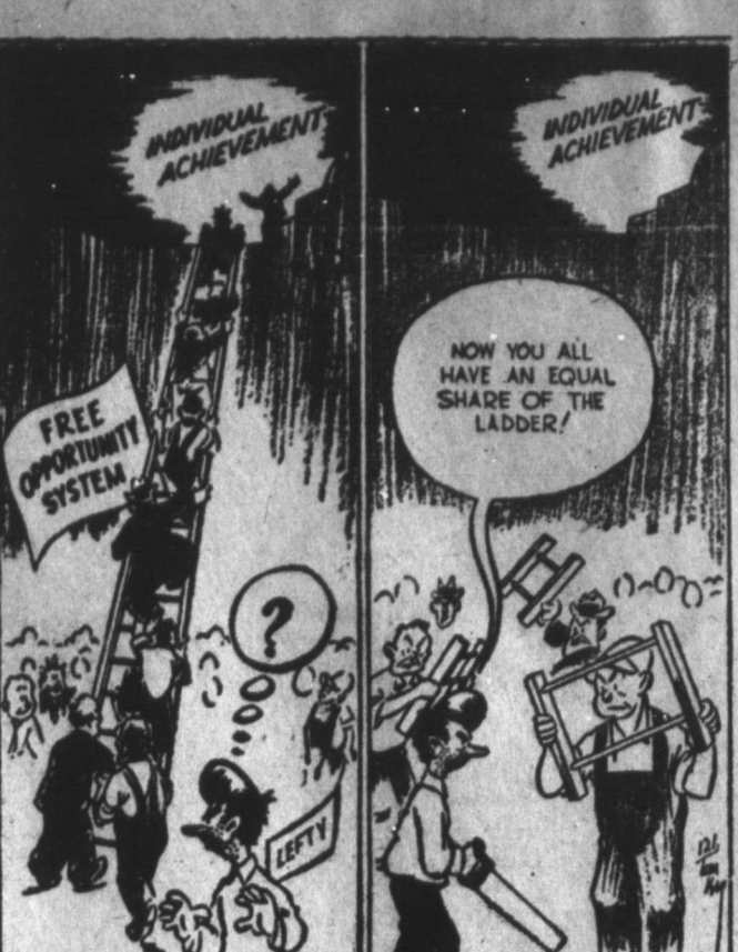
Where Do We Go From Here, Lefty?