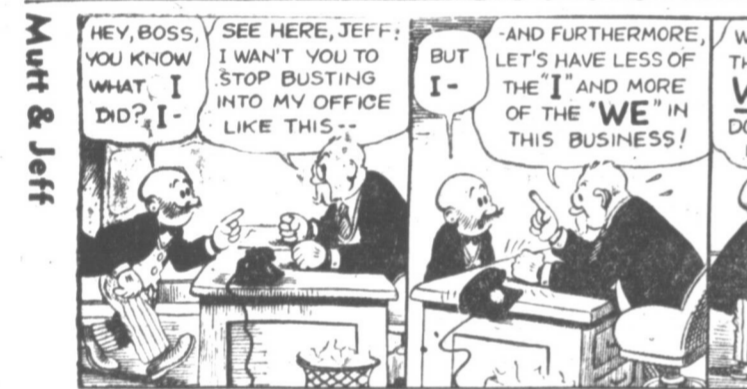
Mutt & Jeff

"We can't put 'em to bed yet—let's wait till they find a deserted island to land on after that shipwreck!"