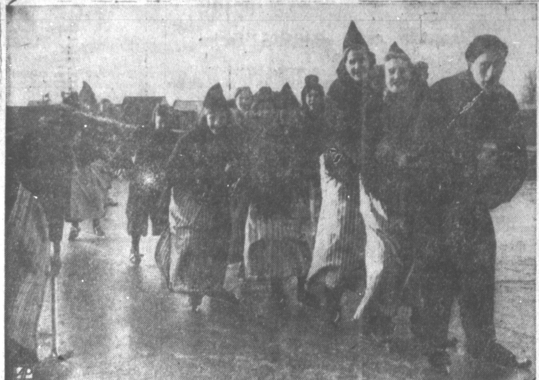
HOLLAND TAKES TO THE BLADES — Youngsters of Volendam, Holland, in their distinctive garb and skates, mass for a game on one of the frozen canals of their little town.