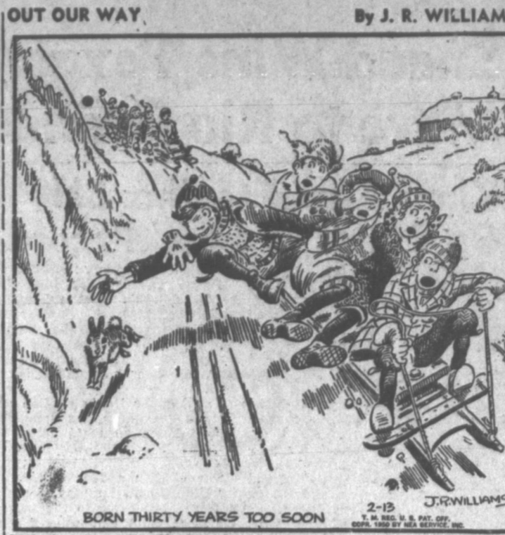
OUR BOARDING HOUSE