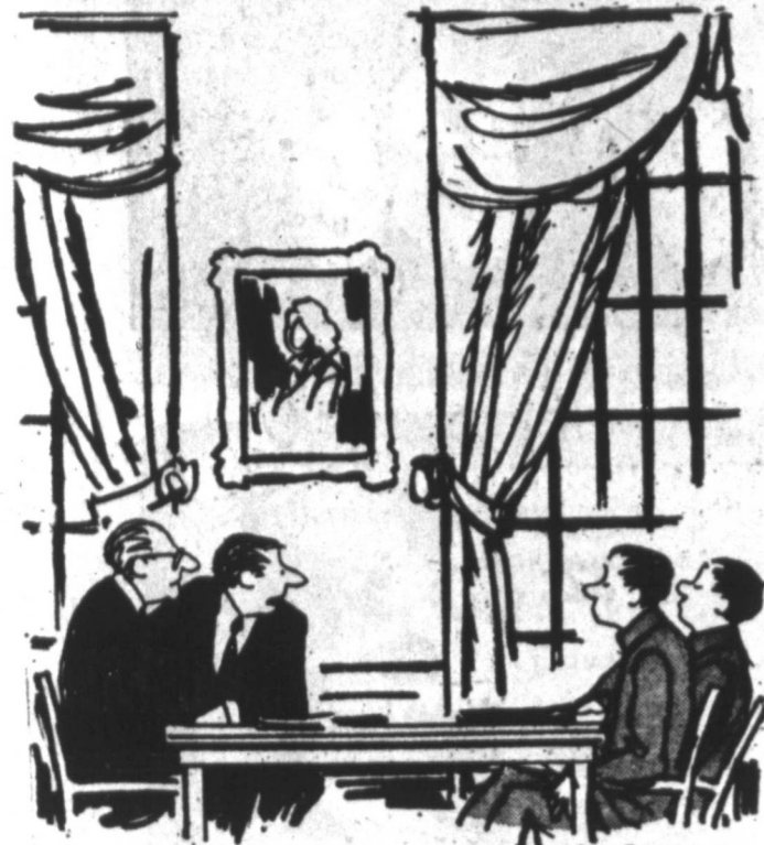
"We don't make idle threats, and if you don't agree to our terms for peace, we may get tough and withdraw MORE troops!"