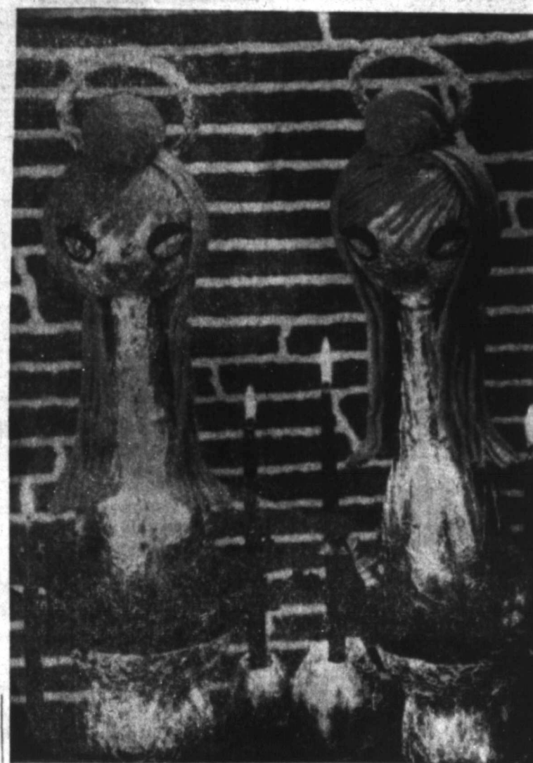
BRIGHT CHRISTMAS ANGELS ... dressed in aluminum foil and yarn