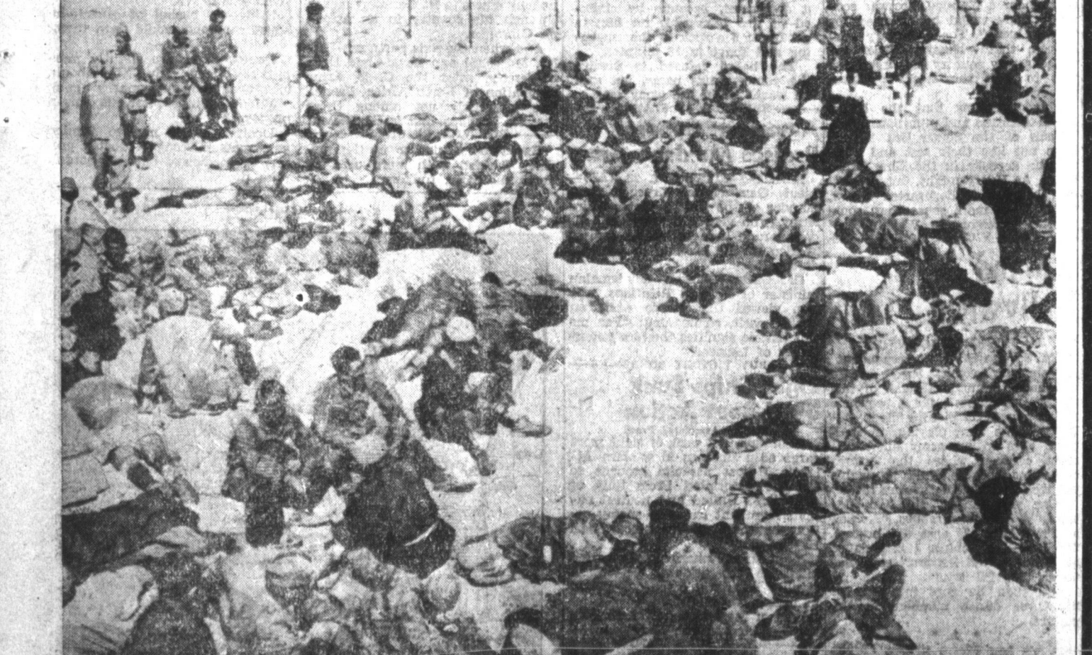
War-worn German and Italian prisoners stretch out wearily in a hastily built British desert prison camp. These are but a few of the thousands of men taken captive by the British since they began pushing Rommel's forces back across the desert battlefields. (Passed by censor.)