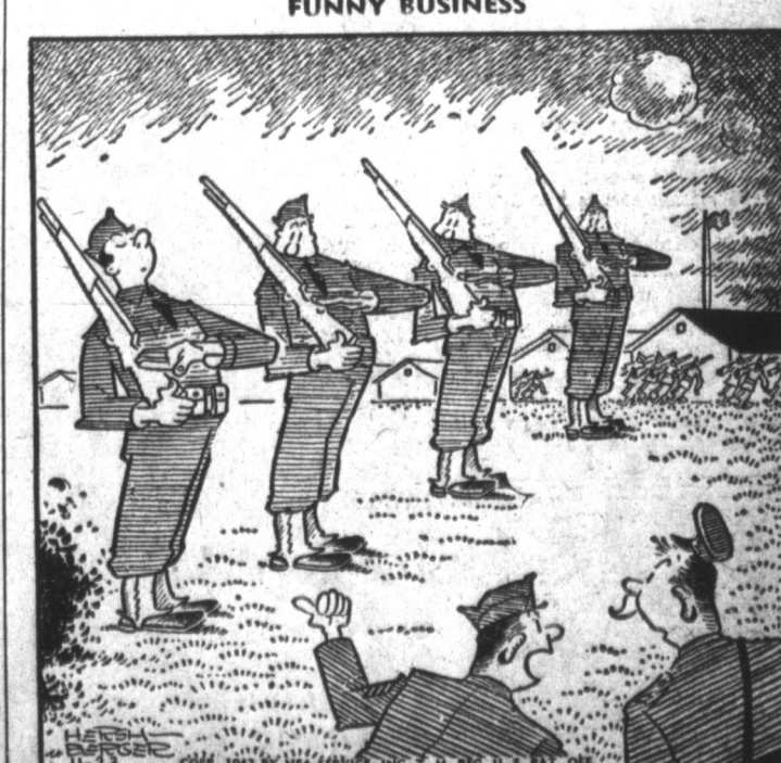
"It's that bellhop again-he always salutes with the