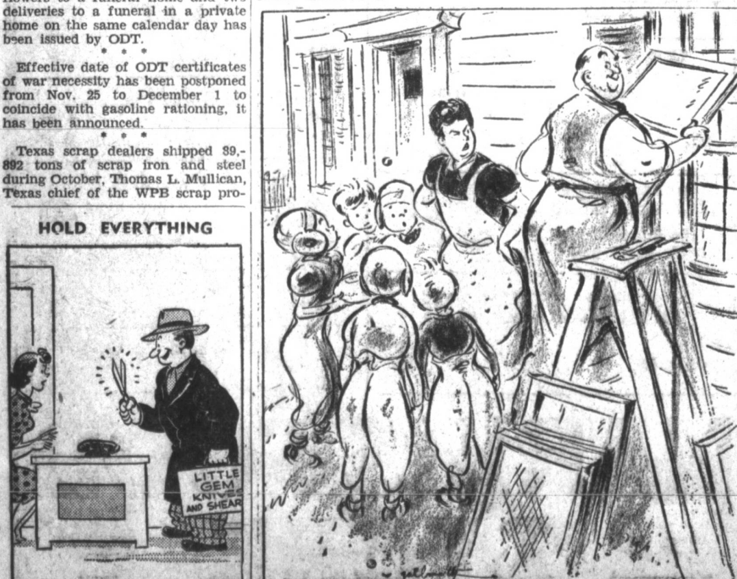
"Couldn't the storm windows wait until tomorrow? Uncle Joe is our first-string quarterback!"

A general permit allowing local flowers to a funeral home and two SIDE GLANCES