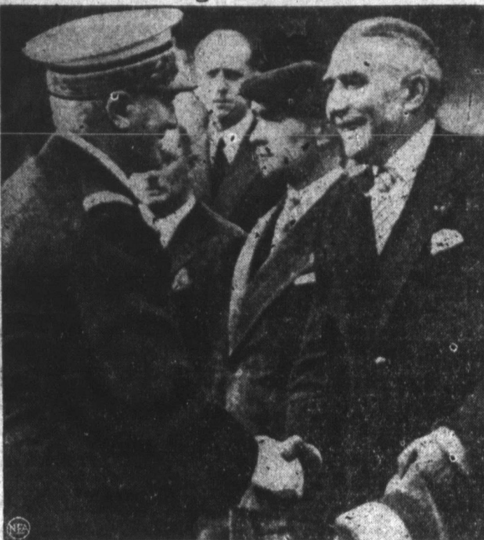
Handshake which helped shake a juicy plum into allied hands was that between French Admiral Jean Darlan, left, who has announced that all French West Africa has aligned itself with the United Nations, and Gen. Pierre Boisson, high commissioner of the territory. Meeting occurred at Dakar on the anniversary of Battle of Dakar.