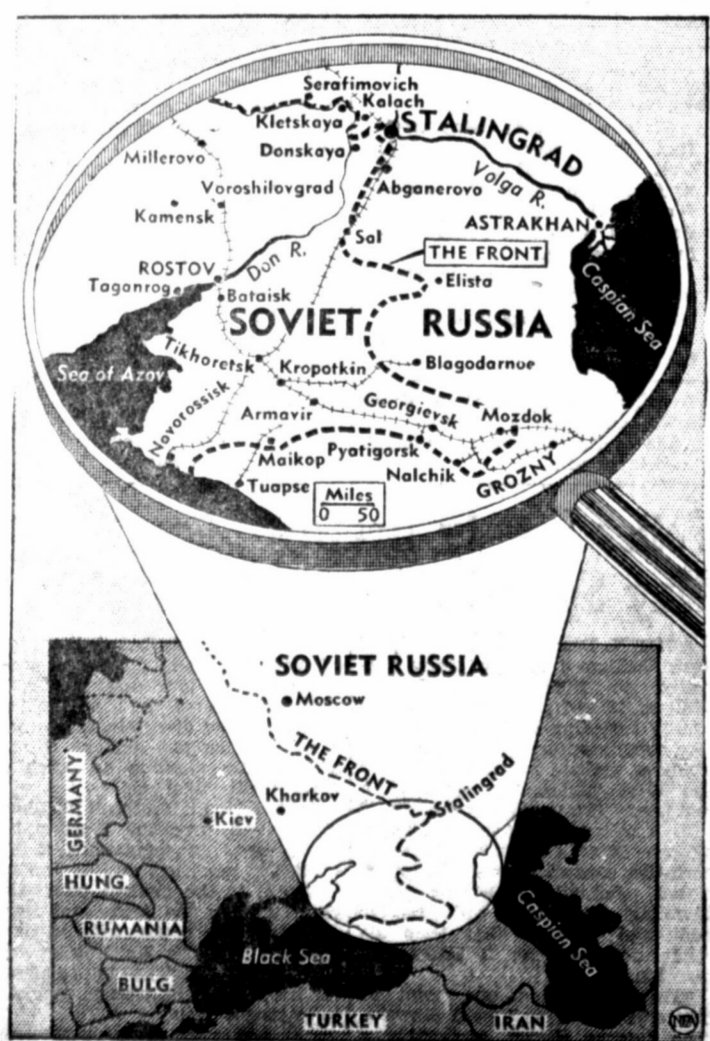
Stalingrad is in the war spotlight again, but this time it's the Russians who are on the offensive. Map magnifies the area where Soviet soldiers are beginning to bite into the flanks of the German column, that has been trying to take Stalingrad for nearly 100 days.