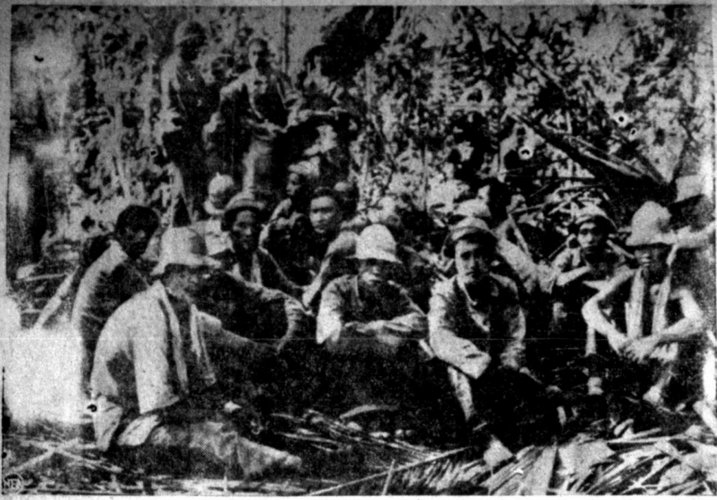
"Go climb a tree," was meant literally when the command was given Jap soldiers by their officers on (above) U. S. Marine sharpshooters, however, brought the nimble climbers down even more rapidly than they went up. Note split-toed tree climbing shoes on prisoners in foreground.