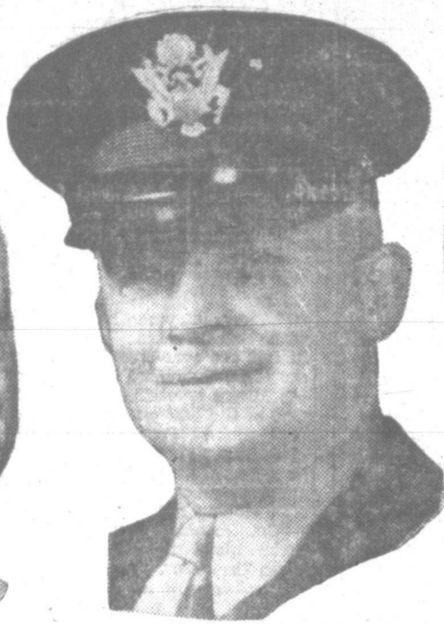
Gen. Henry H. Arnold