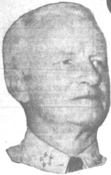
Adm. Chester W. Nimitz