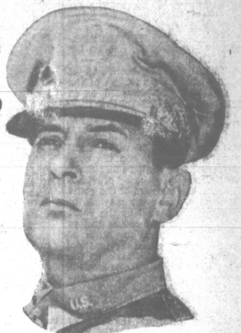
Gen. Douglas MacArthur