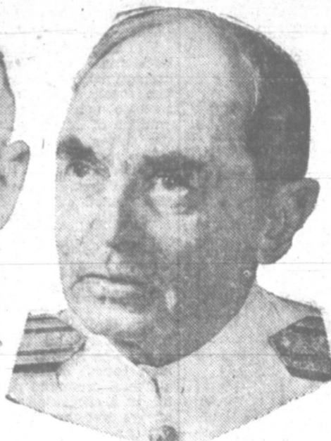
Adm. William D. Leahy