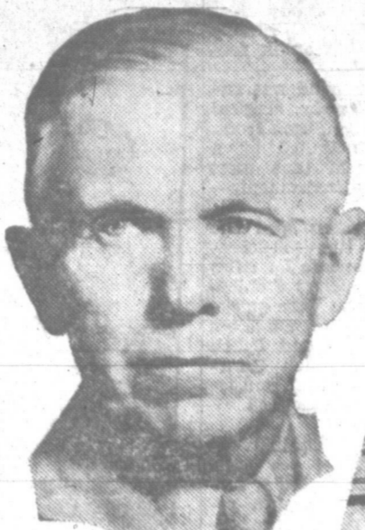
Gen. George C. Marshall