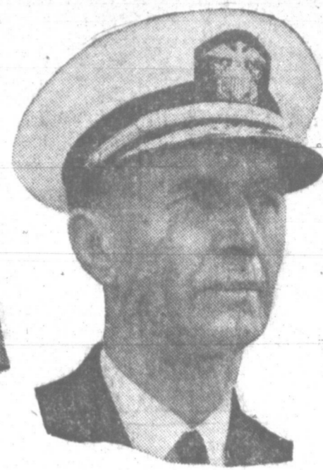
Adm. Ernest J. King