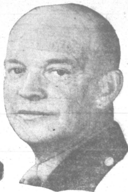
Gen. Dwight D. Eisenhower