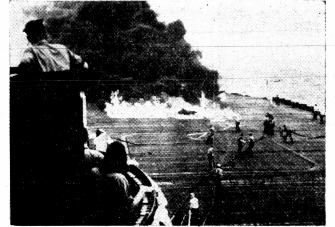
A navy pilot comes in from a mission, creeps the carrier and the plane, the pilot died in the plane.