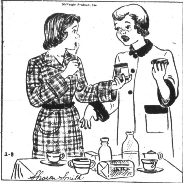
"My womanly intuition is telling me he doesn't love me any more. He hasn't called in three months."