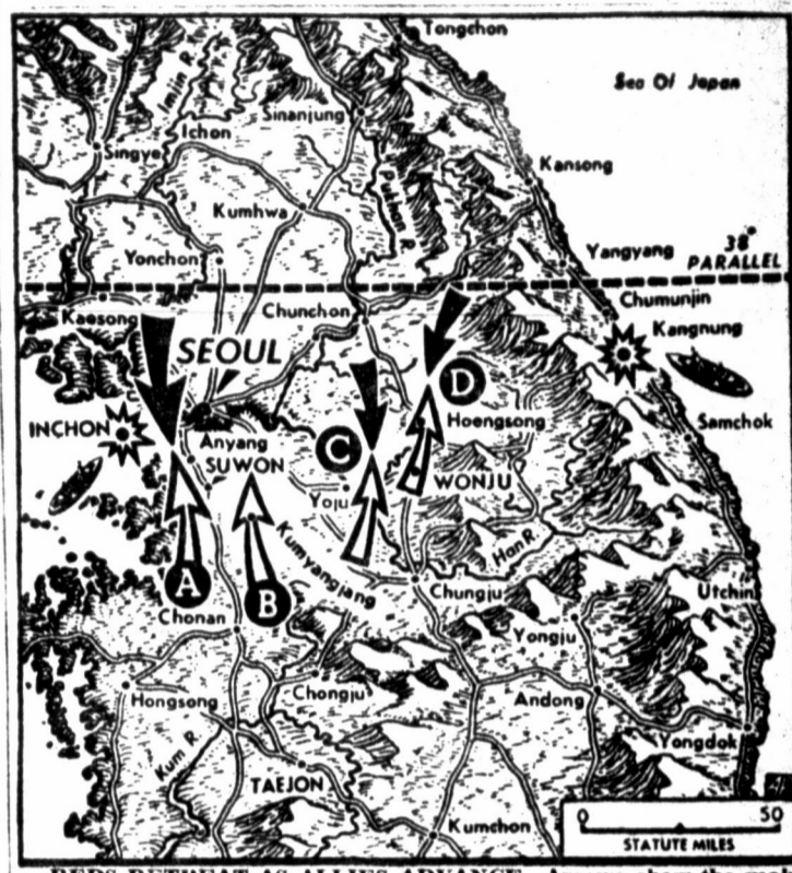
REDS RETREAT AS ALLIES ADVANCE—Arrows show the main points of activity in the Korean fighting. On the approaches to Seoul (A) the Allies gained as much as four miles as the Reds retreated toward the Han River.

TEXAS CITY — (AP) — The city commissioners yesterday voted, 3-2, to locate a sewage disposal plant in the southeast section of the city.