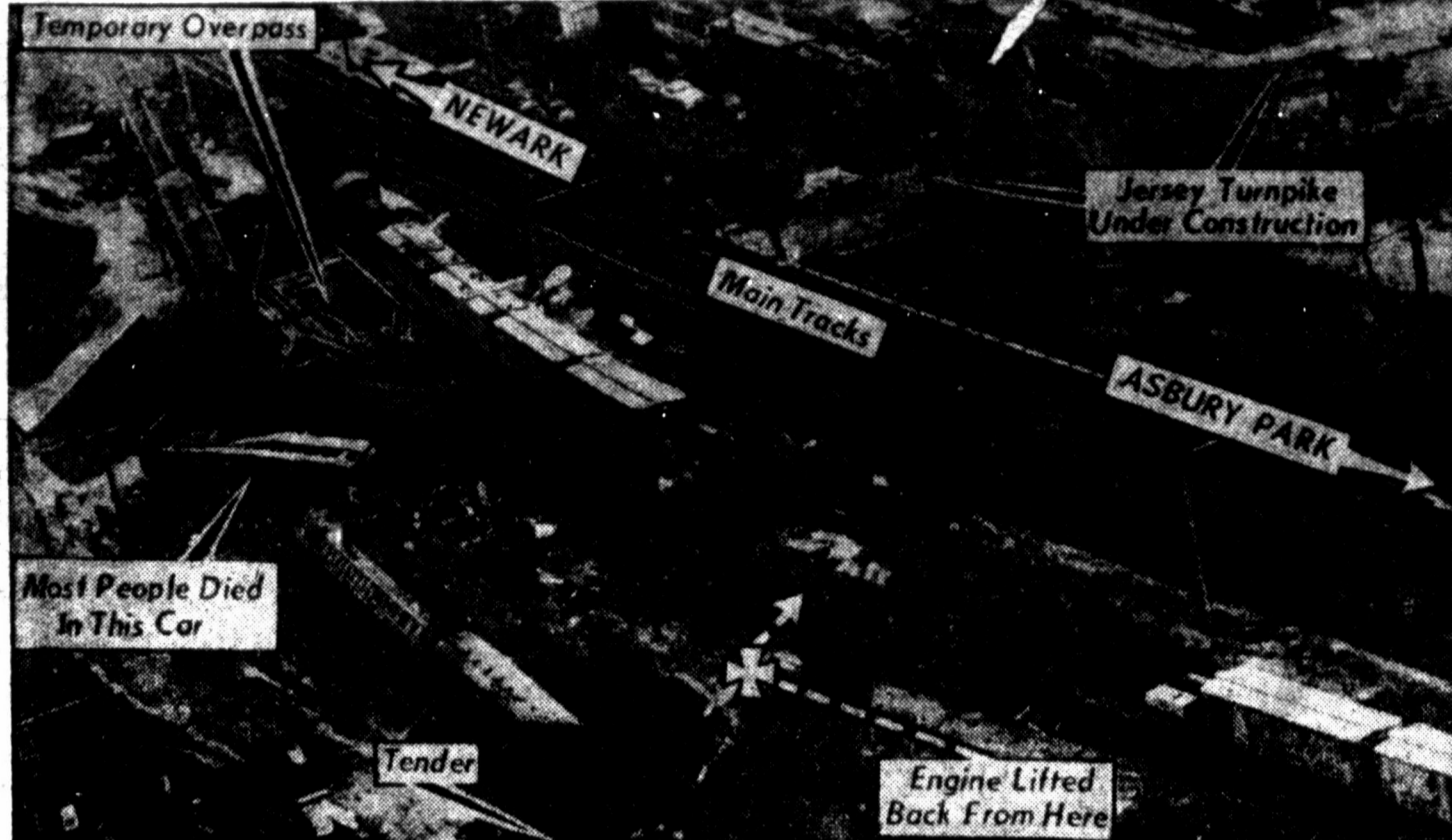
WHERE AND HOW DEATH CAME TO NEW JERSEY COMMUTERS—Here is a diagrammed aerial view of the scene of Tuesday night's tragic train wreck near Woodbridge, N. J.