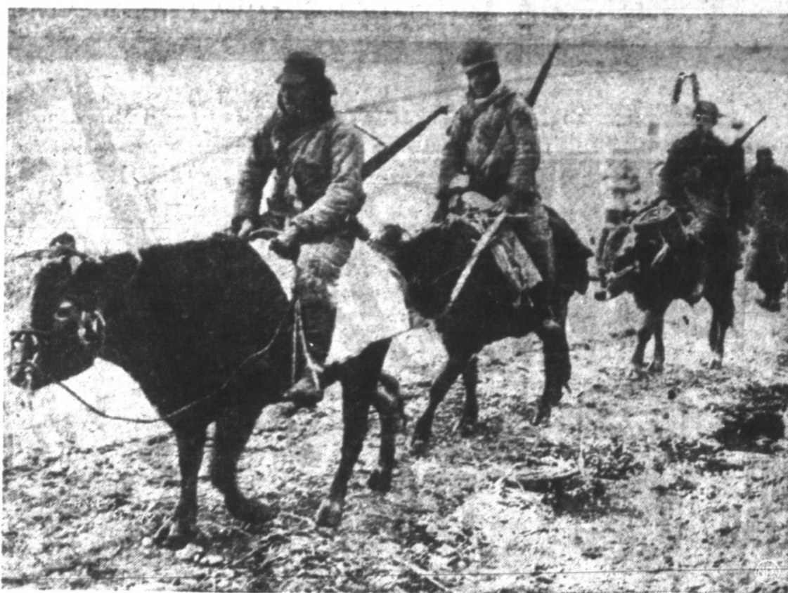
ROK'S BEEF BRIGADE—Heading for the chowline are these Republic of Korea "cavalrymen"—and their mounts. The livestock, "liberated" somewhere along the battle line in South Korea, will provide beefsteak for the troops when they reach the end of the line.

A total of 2214 active units for the past week, compares with 2161 rigs operating a week ago, 496 a month ago and with 2098 in the comparable week of 1950. A comparison by areas for the past two weeks, follows: Pacific Coast, 129 unchanged; Oklahoma, 268, up 3; Kansas, 143, up 16; Rocky Mountain, 111, down 2; Canada, 104, down 2; Ark-La-Tex, 135, down 1; West Texas & New Mexico, 718, up 5; Gulf Coast, 333, up 6; Illinois, 71, up 28.