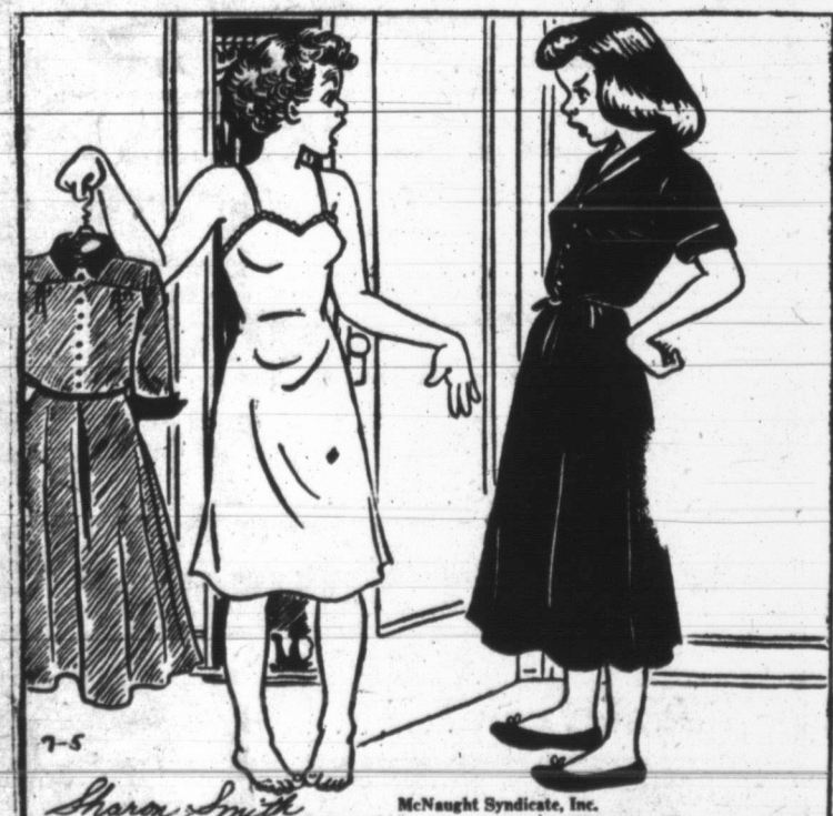
"But this is a big date, Sis—I just can't wear my own clothes!"