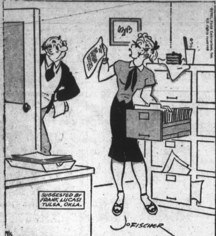
I've been filing this same letter over and over again all day, Mr. Wump. I'm pretty sure now I know where it goes.