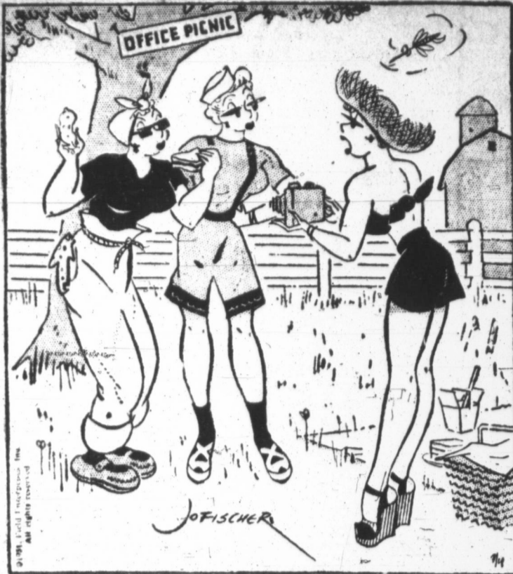
Now pose carefully, girls. I've only got one film left and this is the third picture I'm taking on it.