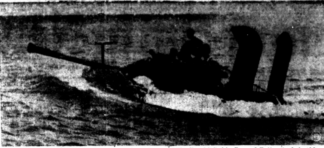
TANKERS AWEIGH—Equipped with a waterproof "fording kit," this General Patton tank is able to ford rivers up to six feet deep. The kit consists of snorkel-like intake and exhaust stacks and reshaped synthetic rubber shields, tace and sealing compounds to close opening in the tank.