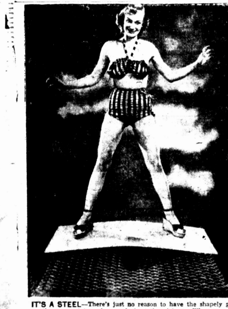
IT'S A STEEL—There's just no reason to have the shapely gal up there except to make you look at the picture. When you do that, you're supposed to notice that she is standing on a sheet of solid steel, supported by a wooden block resting on a sheet of stretched steel. That's supposed, according to the Wheeling, W. Va., manufacturers, to prove that the stretched metal is stronger than the solid. The expanded steel is made by slitting and stretching sheet steel.