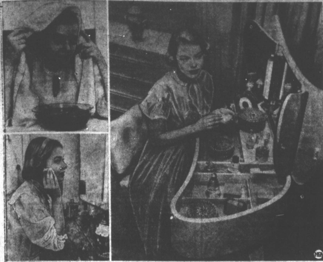
This young woman battles her complexion problem with the aid of beauty products created especially for troubled skins. Since thorough cleansing is the keynote of her routine, she opens clogged pores with herbal tea steaming (upper left) and cleanses her face several times daily with a special lotion that combats oiliness (lower left). For important occasions, when extra make-up is in order, she uses a liquid foundation (right) compounded especially for her type skin.