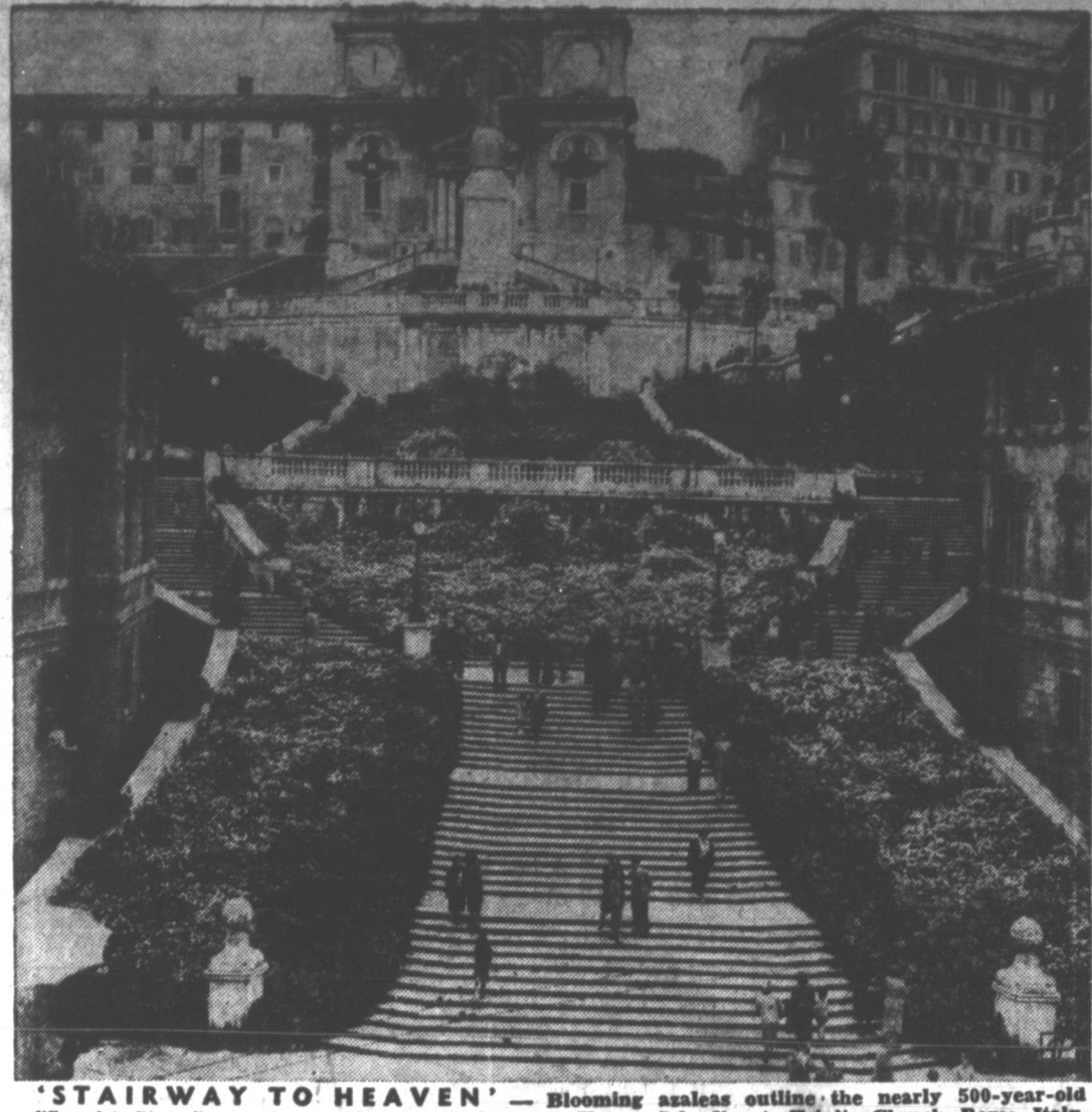
'STAIRWAY TO HEAVEN' — Blooming asales outline, the nearly 500-year-old 'Spanish Steps,' sometimes called the 'Stairway to Heaven,' leading to Trinity Church, Rome, Italy.