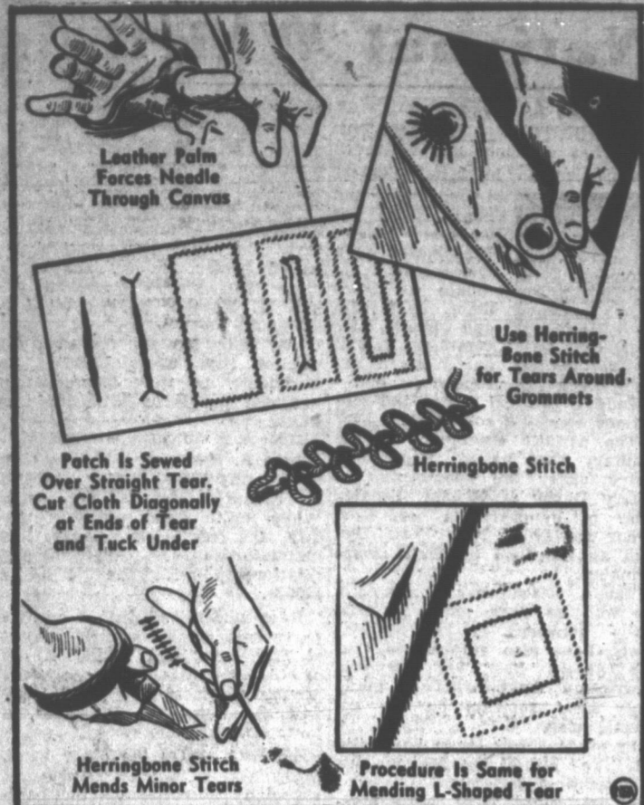
HERE'S HOW to apply sailmaker's technique to repairing awnings.

THE PANHANDLE LUMBER CO., INC. 420 W. FOSTER PAMPA, TEXAS PHONE 1000