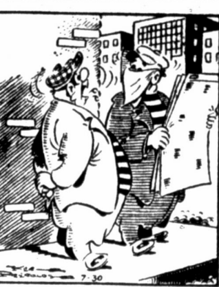
"I don't care what the News Want Ad says — what makes you think you have the qualifications of a butcher?"