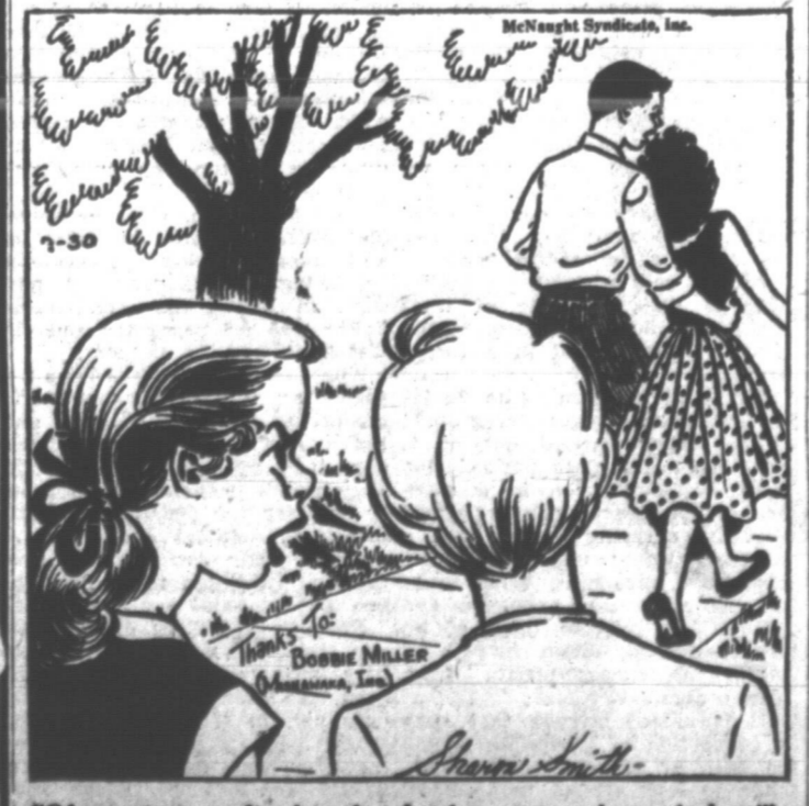
"Of course you realize he only takes her out to make me jealous!"