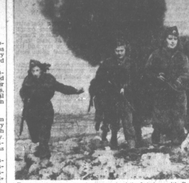
Recovered from wounds received while fighting with General Tito's Partisan forces, the Yugoslav girls above are pictured undergoing realistic battle practice, preparatory to return to fighting front. They train at Allied base in Bari area of Italy.

heavy and unreliable." One of the wooden ships may be completed, it was learned from other sources, and the committee left open for negotiation the proposal to build metal planes of the same type. The committee also brought to the attention of congress a 19-month-old complaint against the navy's bureau of ships for allegedly having "stubbornly persisted for over five years" in clinging to an "unseaworthy tank lighter design of its own."