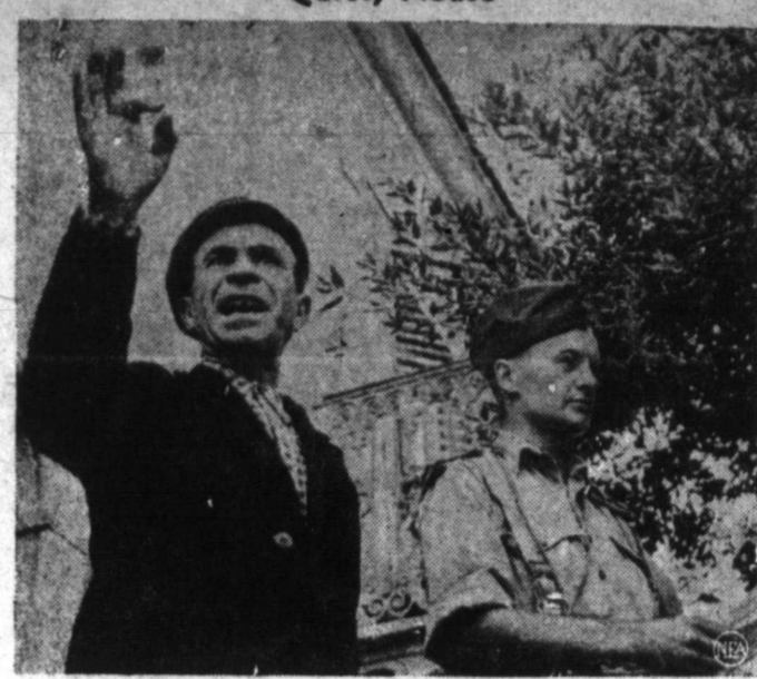
Italian interpreter quiets the crowd as a British Eighth Army major takes over as temporary mayor in the captured town of Castelluccio. Rapid advance of the Eighth so outdistanced AMG that British soldiers had to set up their own government in villages seized from Fascists.