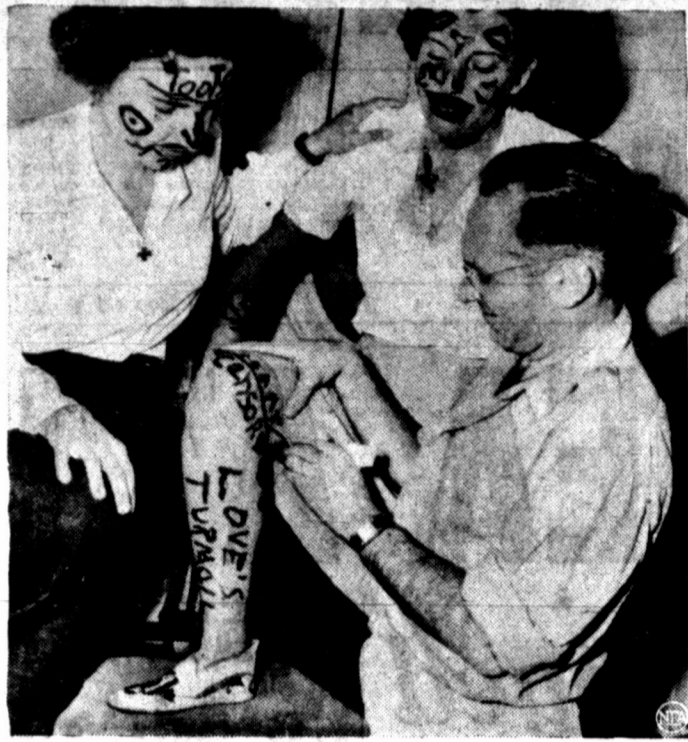
Part of the fun of going to the South Pacific is the time-honored initiation into the domain of Neptune Rex as the ship crosses the equator...