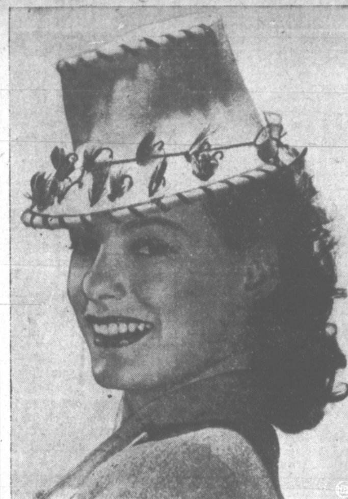
COLORFUL and novel is the decoration on screen actress Faye Emerson's new fall topper: A nostalgic reminder of summer angling days, it is made up of bright—and real!—trot flies hooked into the crown and brim.