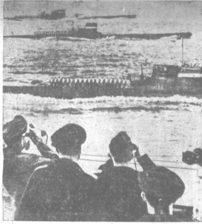
According to German caption on photo above, obtained through neutral sources, picture shows three new German U-boats, crews standing at attention on deck, passing in review somewhere in the Baltic Sea before War Production Minister Albert Speer and Grand Admiral Karl Doenitz, head of the Reich navy.