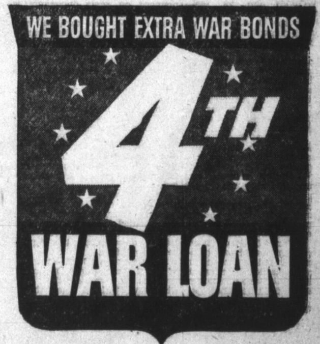
This sticker in your window means you have bought 4th War Loan securities

Ask yourself honestly—how much of a sacrifice is it to give up some luxury just temporarily in order to buy the best investments in the world? When you've answered that question, buy at least one extra $100 Bond now—at your office or plant, if possible. And if you've already bought, buy again this month—and keep 'em!