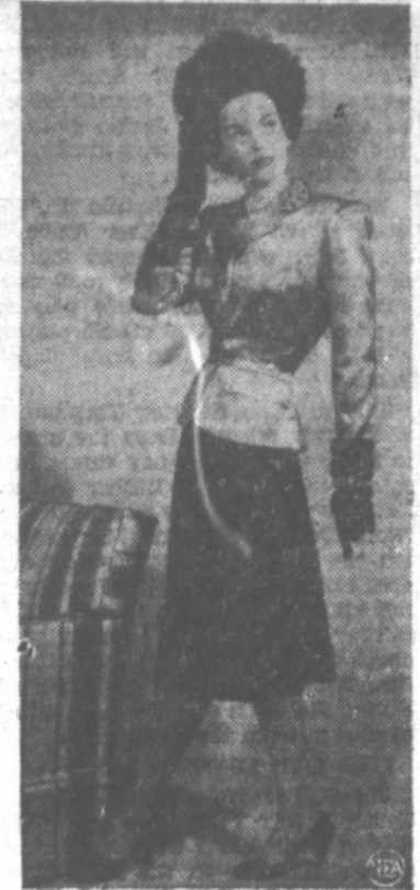
that wrap around, tie, and close at skirt, gored into the new feeling of fullness.

The French dandy's satin toggs influence this year's cocktail suits—dreamy combinations of light and bright jackets lit up by sparklers and posed against slightly flared dark skirts. Example is the Joe Copeland-designed suit center, which combines a waist-hugging, flared jacket of cerise satin, high-lighted by a jeweled collar and a black satin