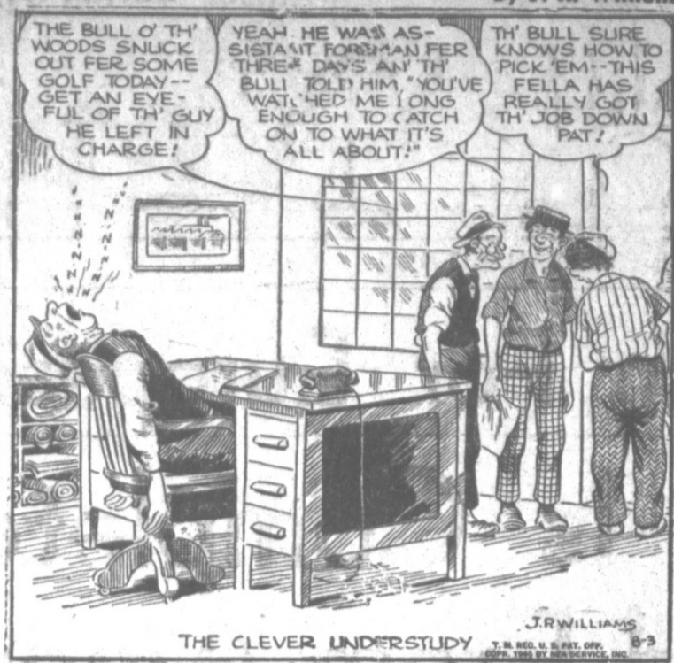
THE CLEVER UNDERSTUDY