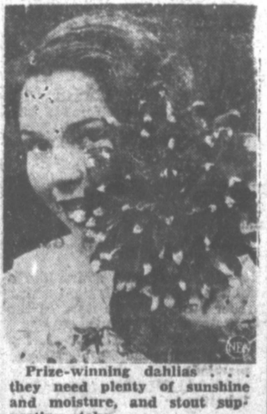
Prize-winning dahlias they need plenty of sunshine and moisture, and stout supporting stakes.

Gladiolus, Too, Need Water and Fertilizer