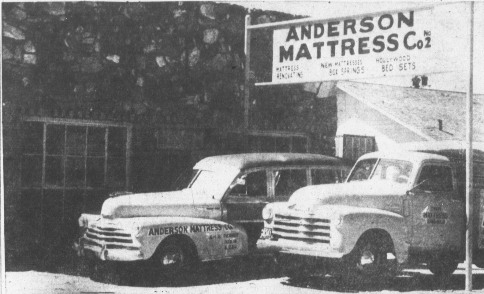
ANDERSON MATTRESS CAN GIVE MORE FOR YOUR MONEY —The Anderson Mattress Factory is one of the largest mattress renovating companies in the Panhandle. They feature modern machinery Felted mattresses. They also offer feather sections and Hollywood bed sets made to your specifications. The Anderson Mattress Company is located at 817 W. Foster and will pick up and deliver your mattress at no extra cost. Call them today and have your old mattress renovated to assure you of better rest.

FREE Delivery Service PANTS 50¢ SKIRTS BLOUSES SHIRTS Service Cleaners 312 S. CUYLER PHONE 1290