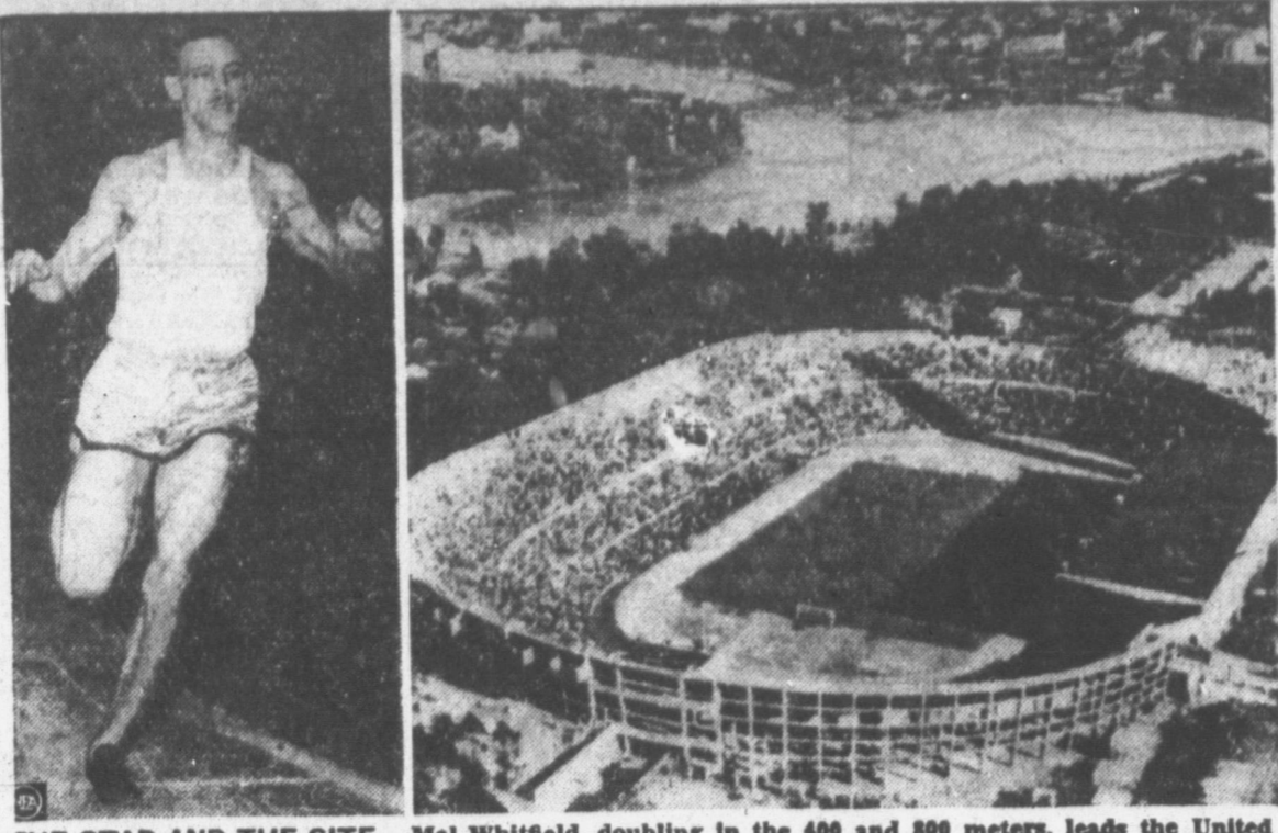
THE STAR AND THE SITE —Mal Whitfield, doubling in the 400 and 800 meters, leads the United States team into Helsinki's Olympic Stadium for the Games, July 13-Aug. 3. The Army Air Force sergeant is the defending champion in the 800.

Sunshine Man 7:45 A. M. Monday Thru Friday With Coy Palmer KPDN 1340 On Your Dial