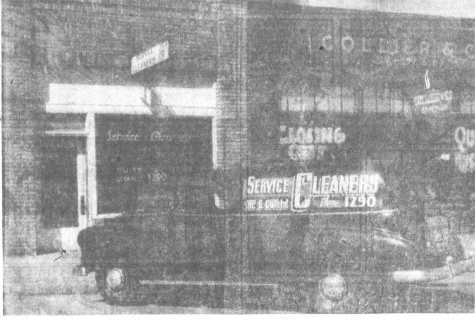
EXPERT RENOVATING METHODS USED AT SERVICE CLEANERS — At the Service Cleaners you can rest assured that your clothing will have the proper care and cleaning that they deserve by expert workmen for less money. Their equipment is modern and up-to-date and will clean your clothes so that they will last longer.