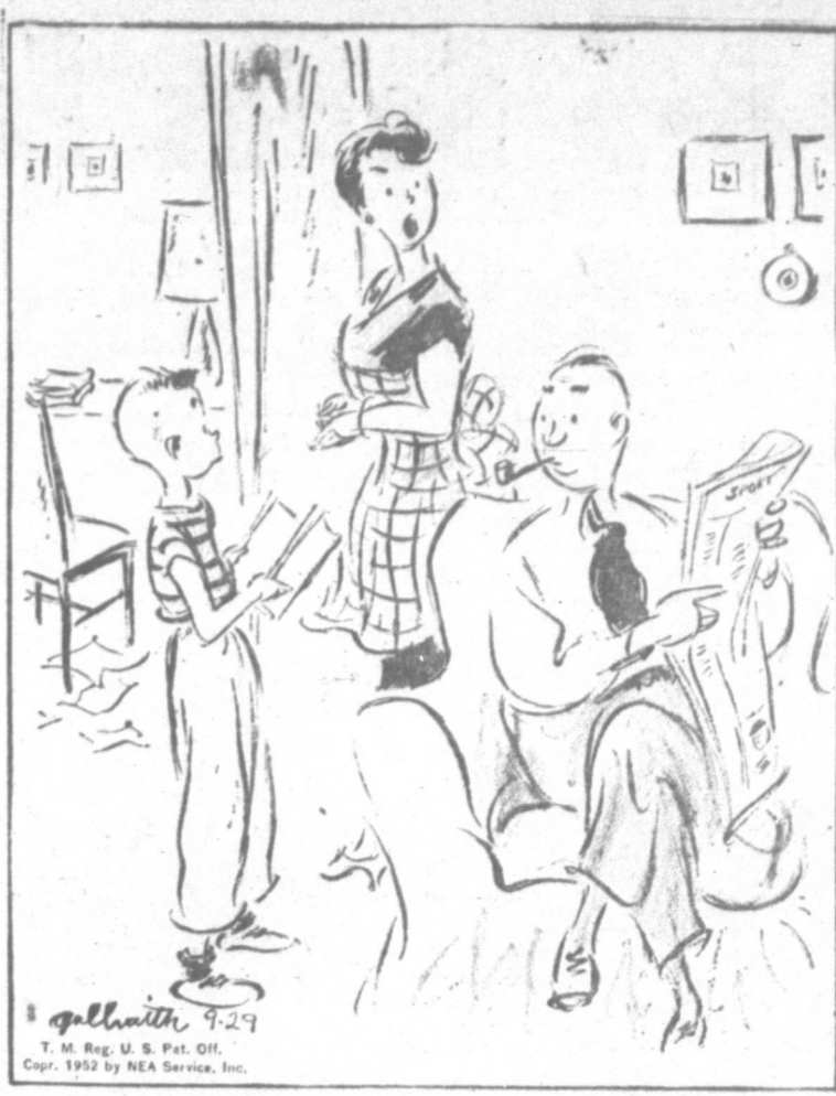
"If he's curious, can't you take your nose out of that paper for five minutes and explain the Einstein theory?"

the city would have to go through acquisitions. Mayor Bowron finally went to Washington in an effort to break the deadlock. He returned with the announcement that the program had been cut from 100 million to $35,447,467 and the number of units from 10,000 to 7,000. Three projects were revised to provide three-story instead of 13-story units. The voters turned thumbs down on the program. Despite repeated court orders and contempt proceedings, the council continued to block site