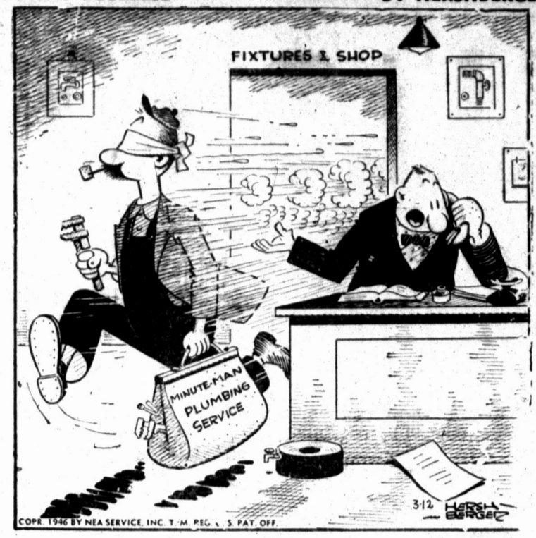
"Never mind getting out of the tub—our bathtub plumbing specialist will!"

SHIP SAILING YOKOHAMA, March 6.—(AP)—The army hospital ship Ernestine Korranda will leave Thursday for the United States with 350 army, navy, marine and merchant marine patients. The vessel will stop at Kobe and Okinawa to pick up others.