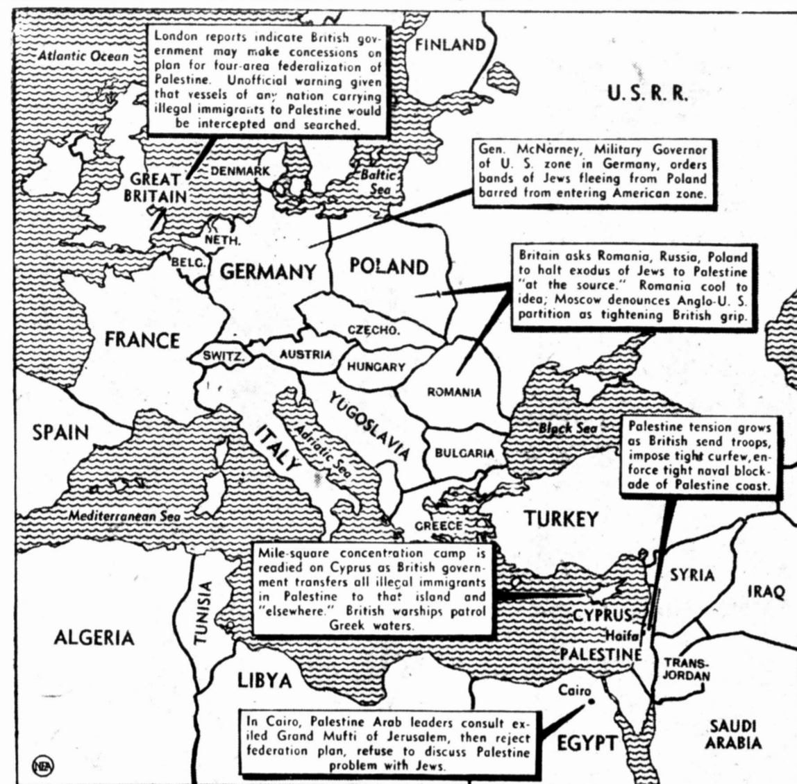
PALESTINE CRISIS IS INTERNATIONAL PROBLEM—Map above shows developments in the Palestine situation as Great Britain takes drastic steps to stop further entry into the Holy Land of hundreds of Jewish refugees from Eastern Europe.

VOL. 45, No. 112. (10 Pages) PAMPA, TEXAS, FRIDAY, AUGUST 16, 1946. Price 5 Cents AP Leased Wire