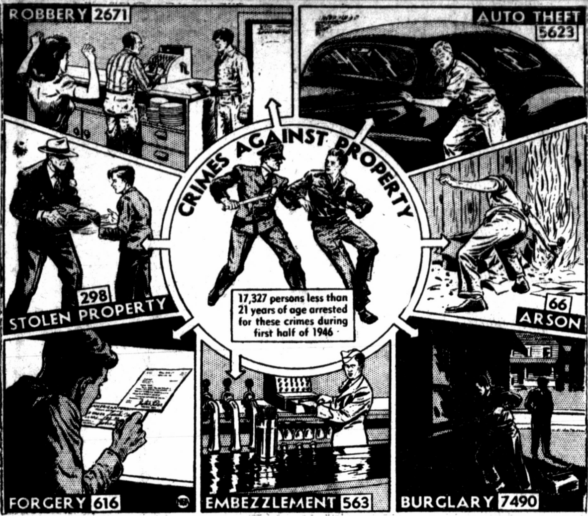
YOUTH STILL HIGHLIGHTS CRIME REPORTS — Newschart above shows the prominent role played by juvenile delinquents in crimes against property, according to FBI reports. For the crimes illustrated, a total of 54,554 persons of all ages were arrested in the first six months of 1946. Of these, 17,327, or over 31 percent, were less than 21 years old. The FBI points out that the number of arrests is probably incomplete in the lower age groups (15 to 18) because some local authorities do not fingerprint youthful offenders.