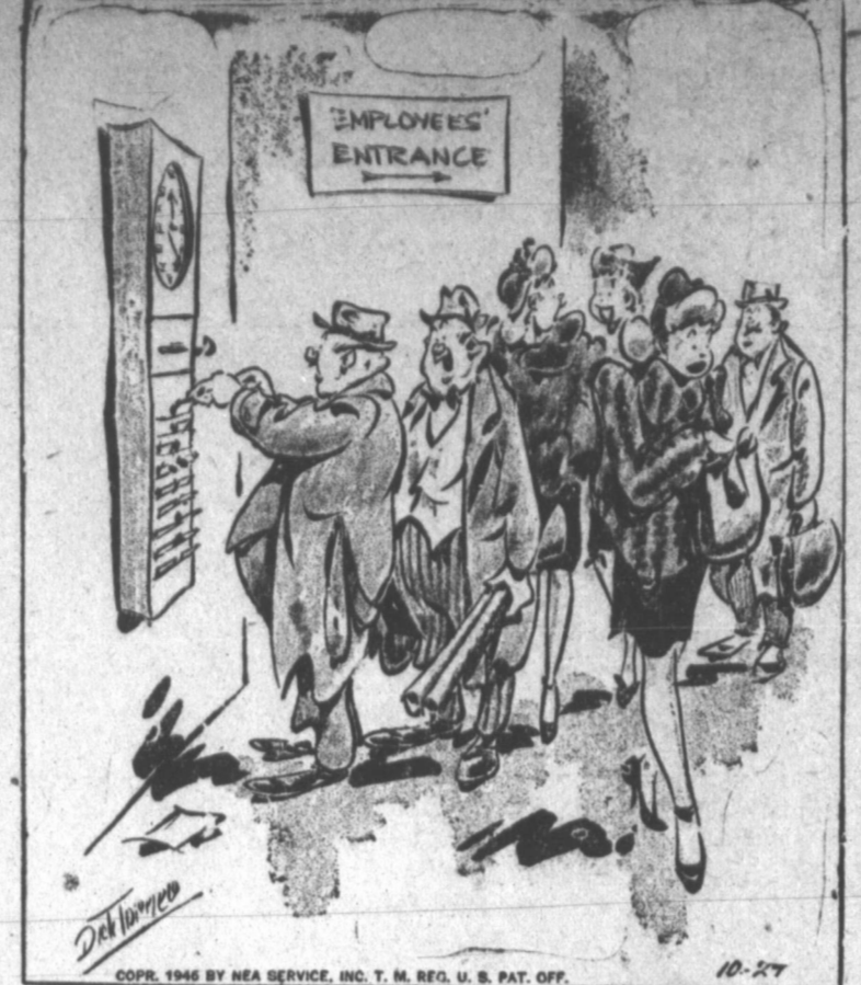
"Personally I prefer the library, but my wife thinks the courthouse pigeons are tenderer!"