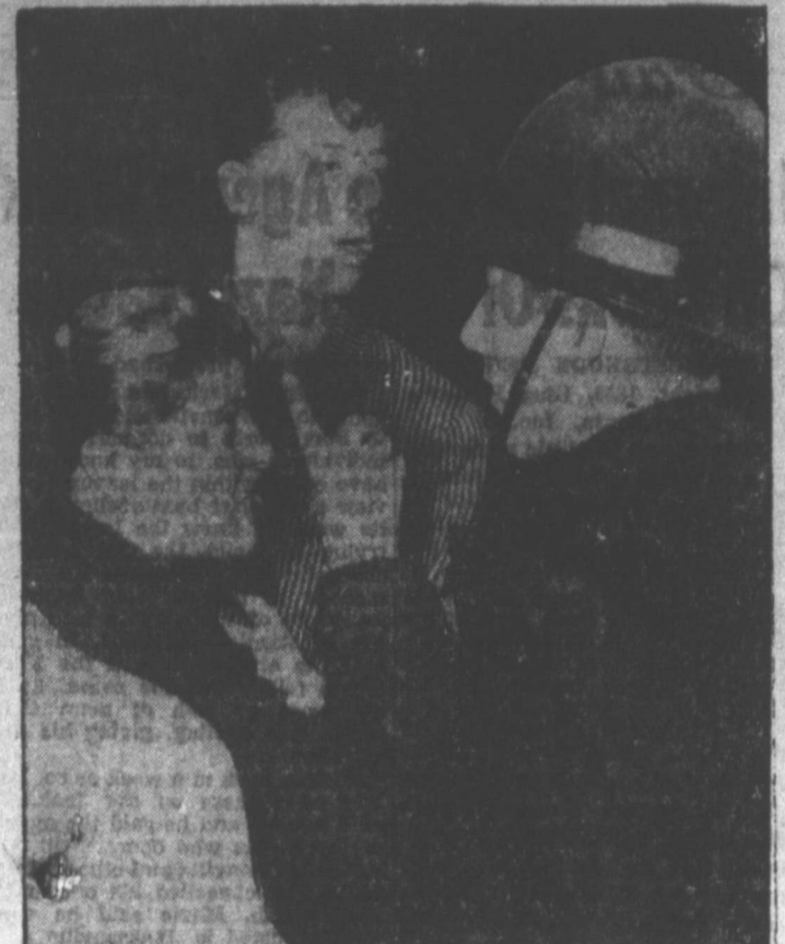
FINGER OF SCORN—"And that goes double in spades!" seems to be the idea as this angry woman gives a policeman a piece of her mind. The aim cop had just moved in to restore peace at the scene of a pro-Tito rally in downtown Trieste.