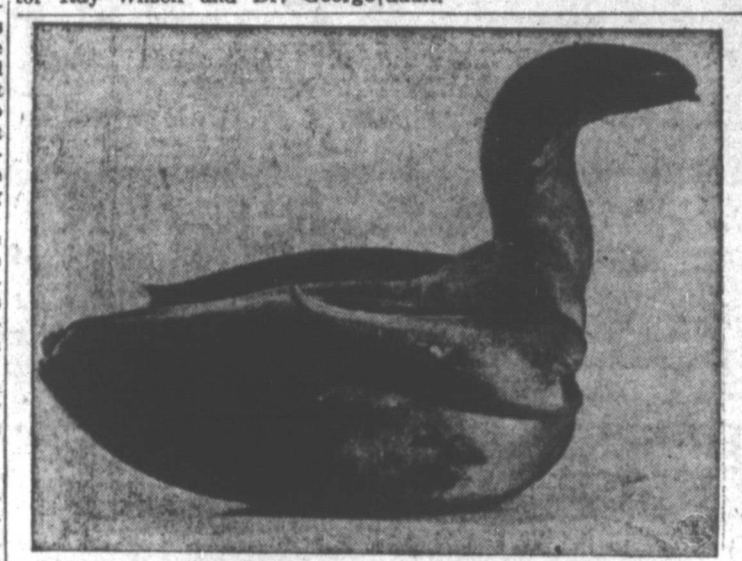
PAPAYA'S JUST DUCKY—What at first glance appears to be a duck hunter's decoy is really a papaya grown in Manila, Philippine Islands, whose the vegetable abounds, often in odd shapes and sizes. It might well establish a new trend in hunting equipment—edible decoys.