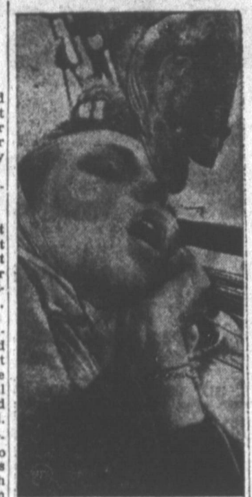
SLUMBER SONG—Looks as if they're singing a duet, but the young lady is asleep and the fish is beyond singing—if he ever could. Camera caught the odd twosome when the tired fisherman drowsed off while coming in with her catch from the waters off Greenport, Long Island.