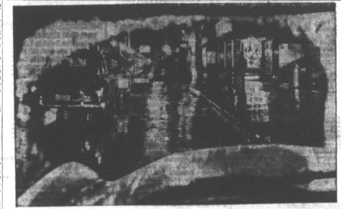
BEAUTIFUL WEATHER—Rain, beautiful rain, the first "soaker" in nearly two months, drenches downtown Denver, Colo., writes a watery finish to the drought. Too late to aid stockmen during the present growing season, it nevertheless promises good growing for the year to come.

Beautiful Weather—Rain, beautiful rain, the first "soaker" in nearly two months, drenches downtown Denver, Colo., writes a watery finish to the drought. Too late to aid stockmen during the present growing season, it nevertheless promises good growing for the year to come.