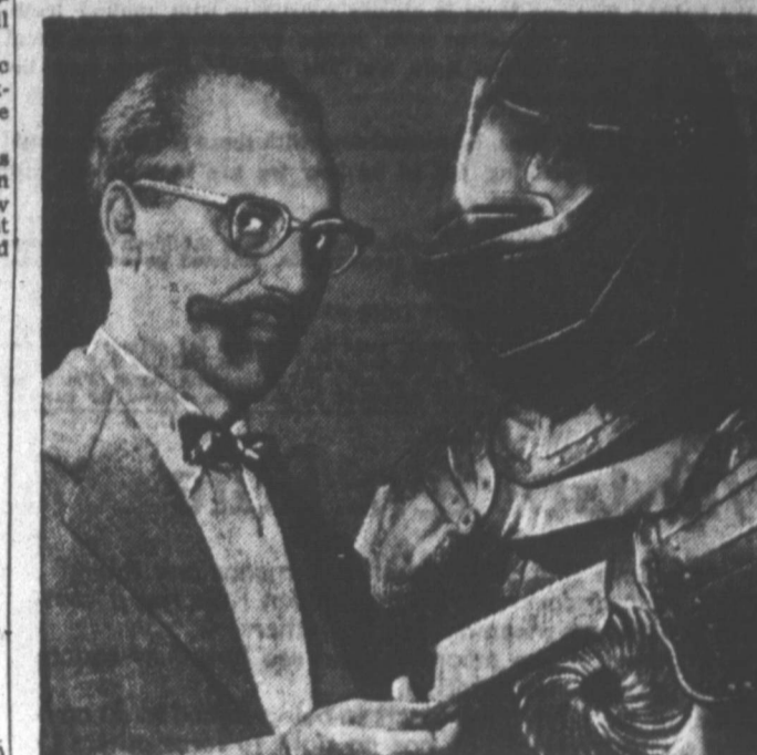
GROUCHO SAYS, "I just got a knight letter saying the NEW 1954 DE SOTO will be out Nov. 5th . . . at your De Soto-Plymouth dealer . . . and tell 'em Groucho sent you."