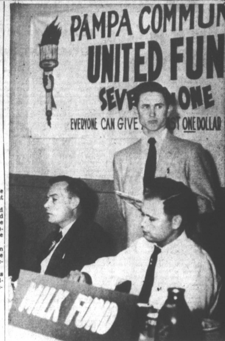
PAMPA COMMUNIST UNITED FUND DRIVE. SEVERAL ONE DOLLAR DONATIONS. EVERYONE CAN GIVE AT ONE DOLLAR.

Wheat prospects in Gray County are the "best in several years," a survey conducted by The Pampa News revealed today.