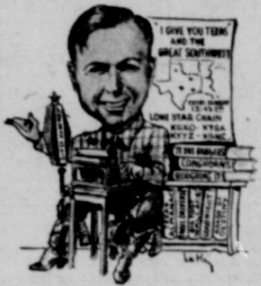
By BOYCE HOUSE

Texas State News (Published at Austin): The curtain is about to rise on Texas' greatest political show in many, many years. The actors have been busy the past few weeks adjusting their false whiskers, padding their bosoms, rehearsing their gestures and figuring out new ways and means of fooling the suckers who will flock to see the show and pay the bills. The show will be unique in that you can pick out your own hero and your own villain—either of the actors will fit either role. . . . Such a guy might be a plain Texas GI who would have the guts to make the Ten Commandments, the Sermon on the Mount, and the Constitution of the United States, the planks of his platform. We're hopin' too.