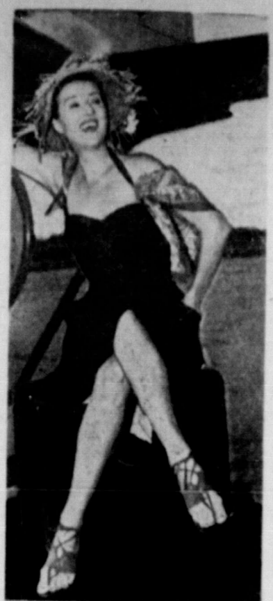
RETURN OF GYPSY . . . Gypsy Rose Lee, famous showgirl and novelist, gives benefit performance in New Orleans for victims of hurricane "Audrey."