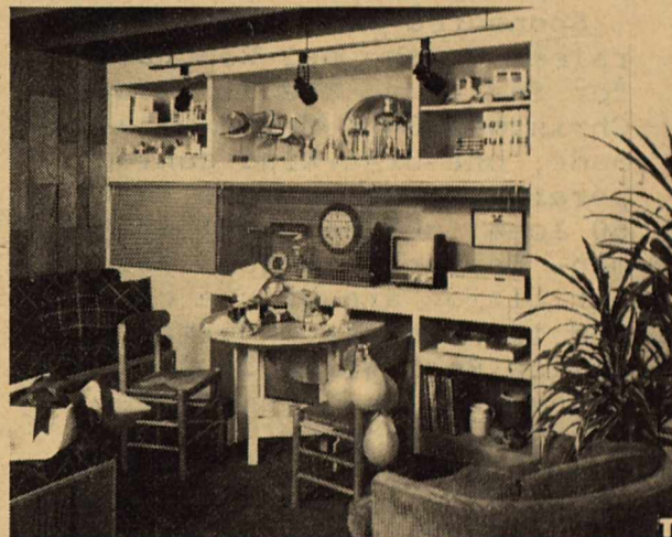
For a living room, family room or even a bedroom, this versatile cabinet can be just the answer to your storage needs.

Lifestyles in the 1980s are changing and more people are looking toward smaller homes and condominiums for their housing needs. That means smaller spaces and less storage so it's important to maximize your space. This contemporary entertainment center can solve your space problems, and it's easy to build, too.