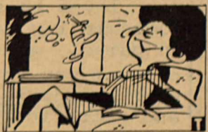
Most upholstered furniture has been designed to resist ignition by a burning cigarette.

You might also like to learn more about recent advances in upholstered furniture construction which can make it more cigarette resistant. Most upholstered furniture in the marketplace now offers a new feature for your consideration. The furniture industry for the past ten years has invested millions of dollars researching new materials and methods to manufacture furniture that is more resistant to burning cigarettes. This safer