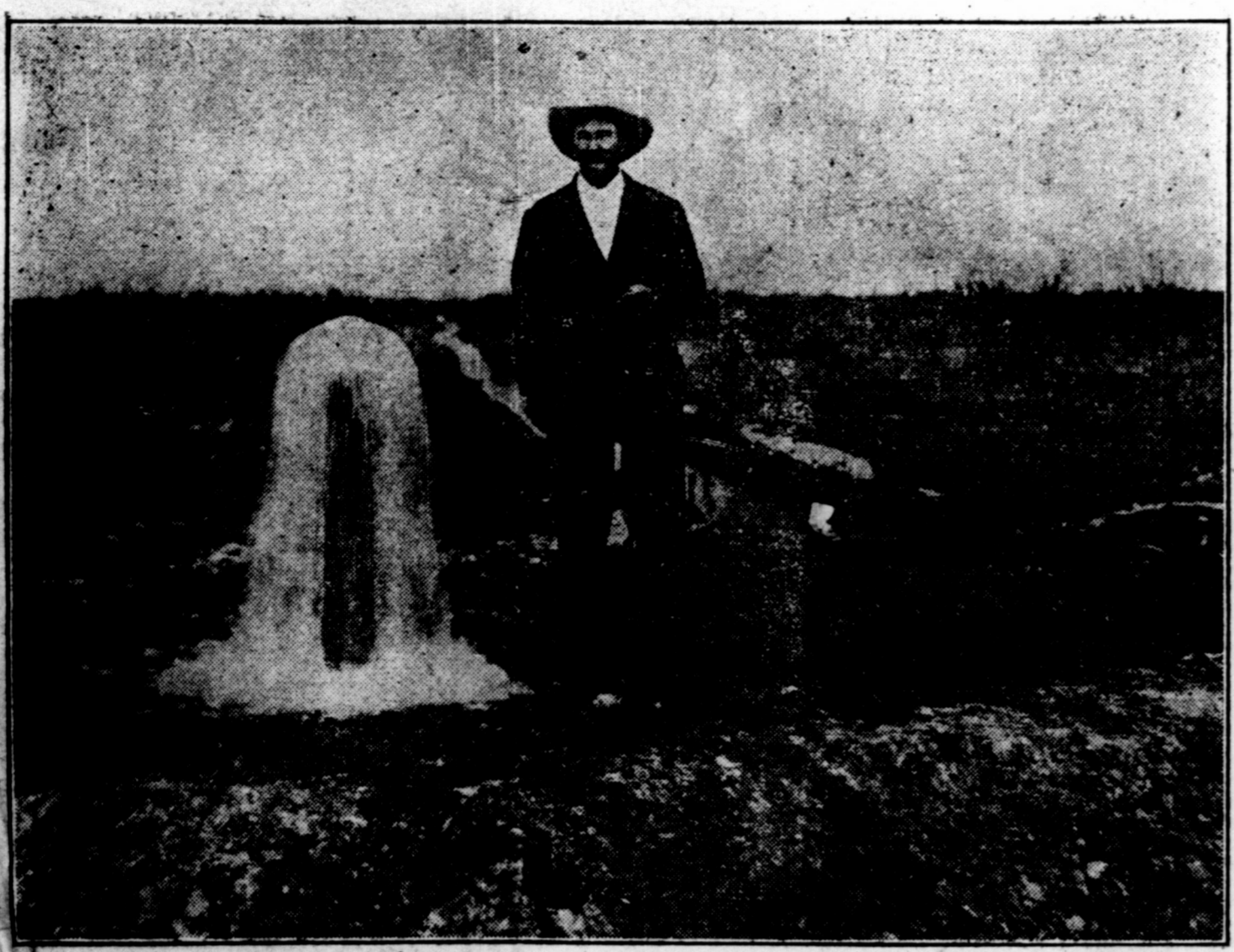
Located One Mile from Macie and 10 Miles from Brackett and Spofford

A country is as rich as its soil is a true saying, as is the one that a man is as strong as his stomach. The soil is the first great necessity with which to provide all other necessities, and the better the soil is, the better it provides for all necessities and emergencies.