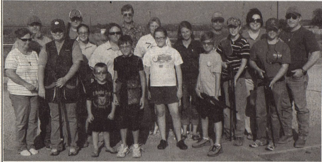
Borden County 4-H'ers and their parents have met on Tuesday nights throughout the summer to practice trap and skeet at the Gail Trap Club shooting range. They have competed in many shoots throughout the state of Texas and will be attending the State 4-H Shoot later this month.