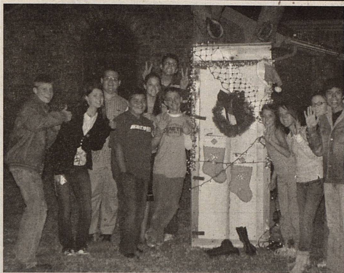
You Better Watch Out.... The First Baptist Church Youth Outhouse is in town. You could be next!